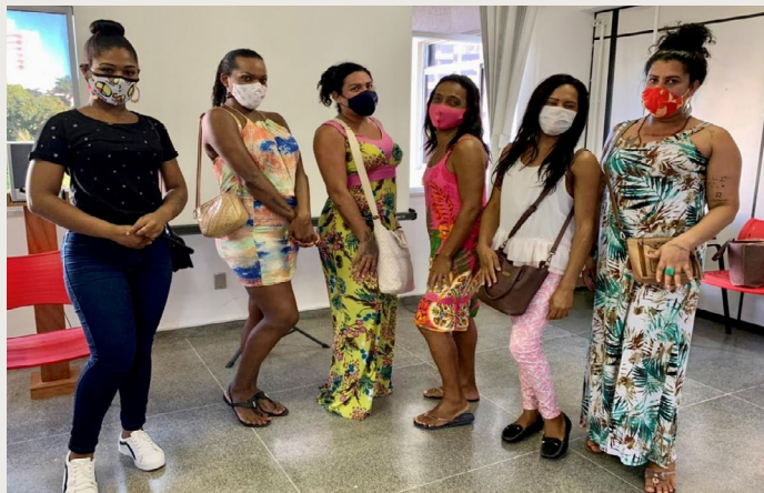
Trans human rights defenders who participated in the Transformação project.

OHCHR launched the international Free & Equal campaign in 2013 and the Brazilian campaign began in 2014. During 2021, the campaign reached more than one million people in Brazil through social media.