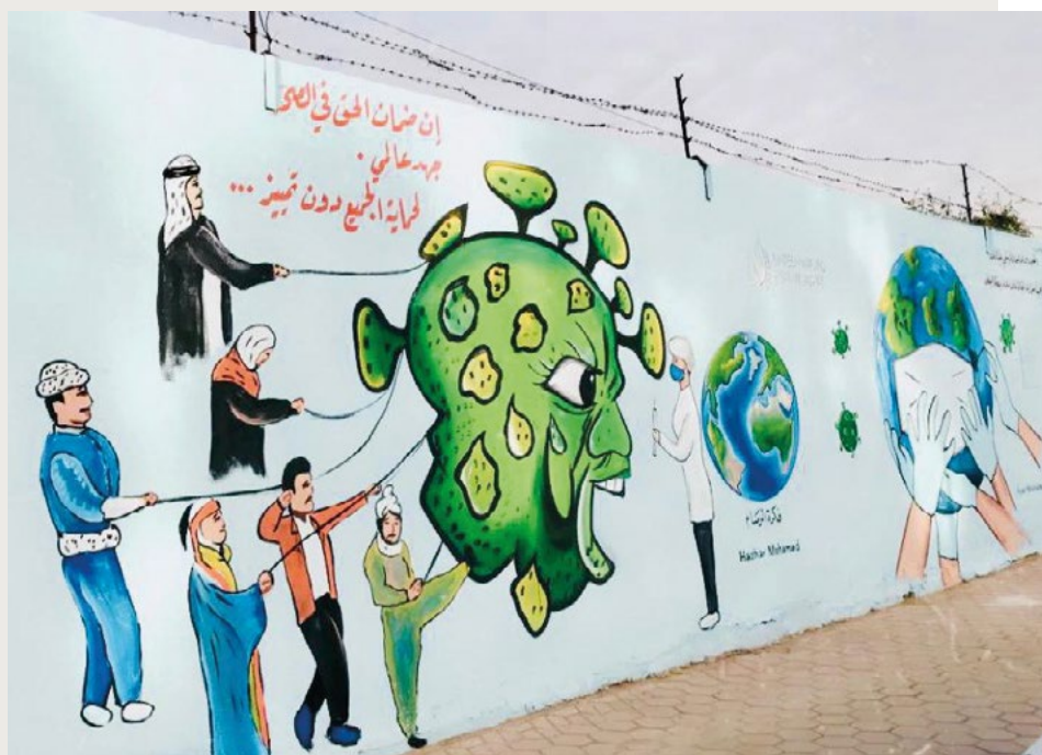
The mural illustrates the community fighting together against the pandemic.