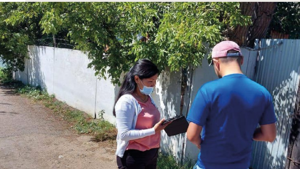
Survey workers piloting the OHCHR-supported SDG 16 Survey in Kazakhstan and listening to respondents during the pandemic.

It is within this context that OHCHR, UNICEF and UN Women collaborated to implement COVID-19 Rapid Gender Assessments (RGAs) in seven West and Central African countries, namely, the Central African Republic (CAR), Côte d'Ivoire, the DRC, Guinea, Mali, Niger and Senegal. The RGAs were developed in close cooperation with national authorities, particularly the National Statistical Offices (NSOs) and the respective Ministries of Gender. The studies aimed to measure the impacts of COVID-19 on different aspects, i.e., social and economic activities, distribution of unpaid care work, education, discrimination, and violence, to support informed and evidence-based policymaking. The RGAs adopted a human rights-based approach to data (HRBAD), which is underpinned by six principles (participation, disaggregation, self-identification, transparency, privacy and accountability), to define the focus of the questionnaire and guide data collection.