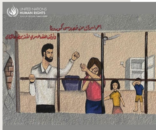
The picture urges “Stop domestic violence, it destroys families!”