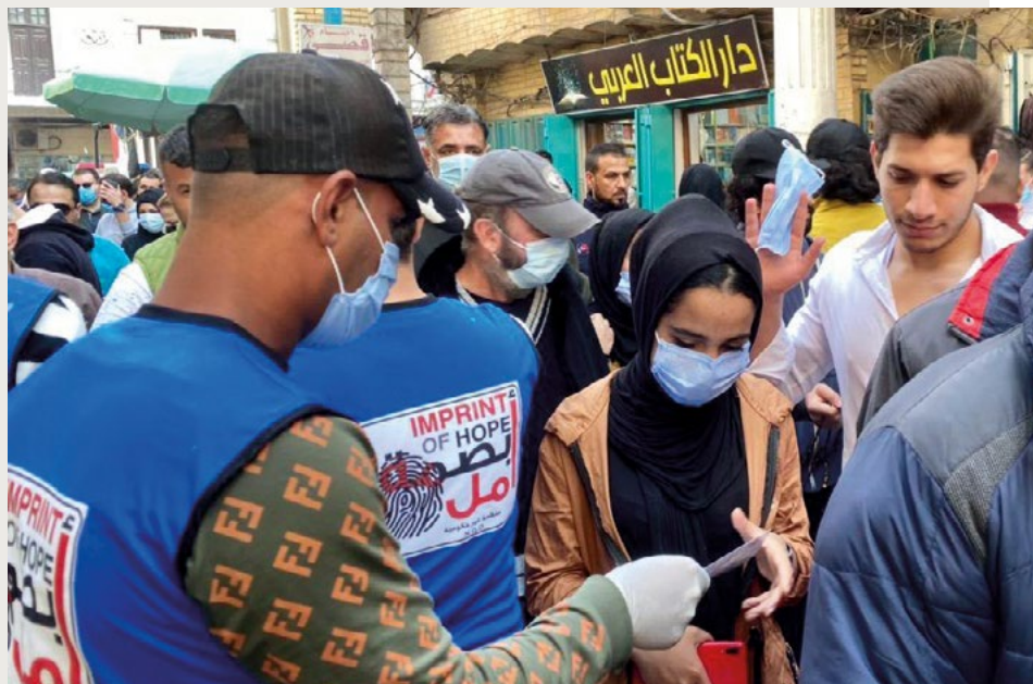
Volunteers distributing postcards.