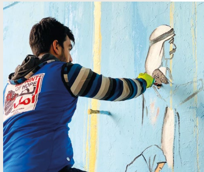
A volunteer taking part in the mural project.

To complement the mural project, 19 Imprint of Hope volunteers, including three women, distributed 10,000 postcards depicting the images and messages of the mural paintings to three Baghdad neighbourhoods.