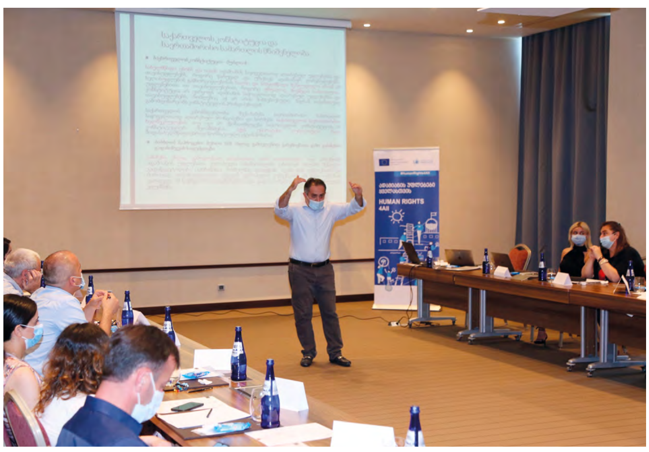
Staff of the Legal Aid Service of Georgia participate in training on international standards on torture prevention, in Batumi, Georgia.