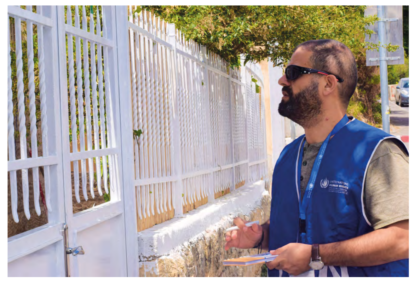
OHCHR staff monitors cases of Palestinian families at risk of eviction in Sheikh Jarrah in East Jerusalem.