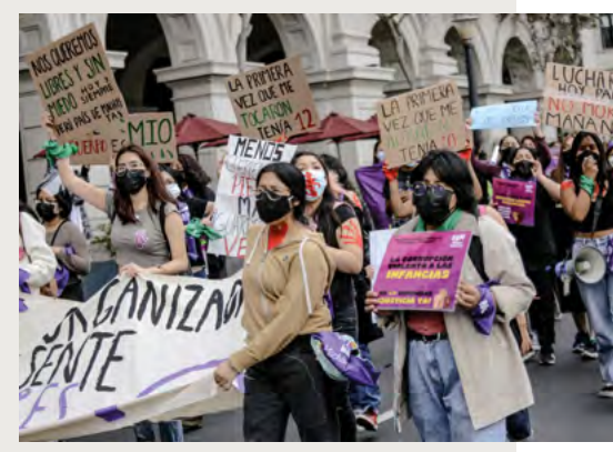
March against gender-based violence in Lima, Peru

One of the best examples of this was Guatemala's groundbreaking 2016 Sepur Zarco court case, which dealt with CRSV against indigenous women during the country's civil conflict. The trial resulted in the conviction of former military members, as well as transformative reparations that included monetary compensation, restitution and rehabilitation. The reparations sought to strengthen access to health and education in the communities of the litigants and supported the development