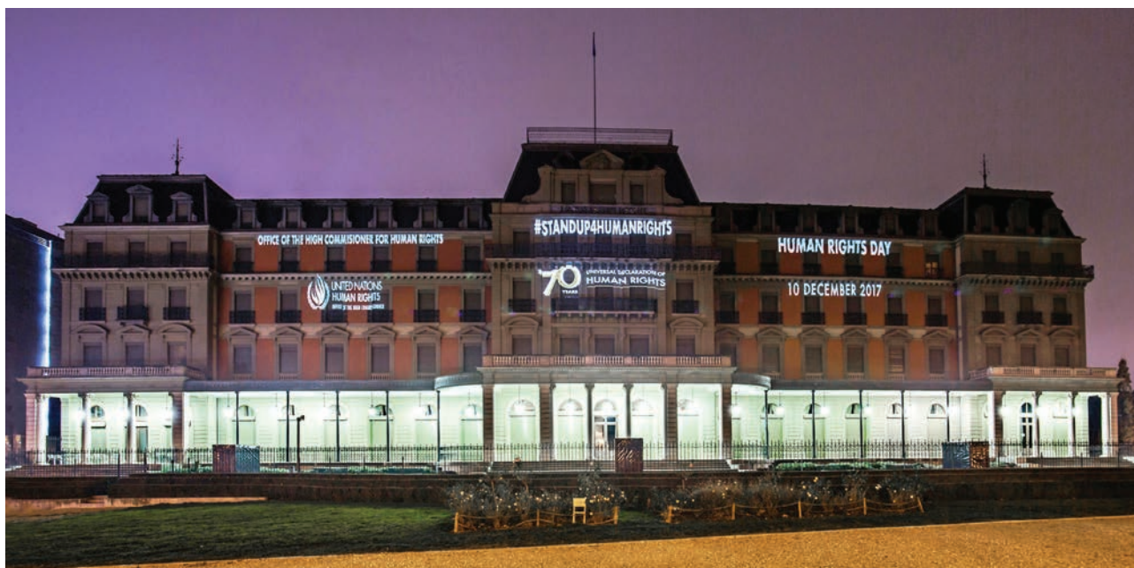
The façade of Palais Wilson, UN Human Rights headquarters in Geneva, illuminated on Human Rights Day, December 2017.

efficiency within the Office. The achievements under these GMOs are elaborated in the Management chapter on page 66.