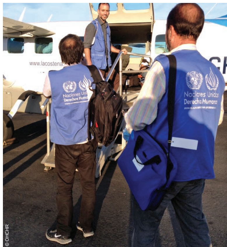
Members of the Subcommittee on Prevention of Torture and Other Cruel, Inhuman or Degrading Treatment or Punishment and OHCHR staff members visit Nicaragua, May 2014.

OHCHR works in close partnership with numerous stakeholders at the global, regional, national and local levels, both within and outside of the United Nations system. Many of these partnerships are of a strategic or operational nature and often involve collaboration between and the pooling of resources of relevant stakeholders with a shared interest in addressing specific human rights needs. Partners include Member States, NHRIs and CSOs at the international, national and local levels, the private sector, foundations, regional and international organizations, Secretariat departments and UN agencies, funds and programmes. In addition, the Office actively cooperates with the international human rights machinery to find effective ways to work together in order to address global human rights issues.