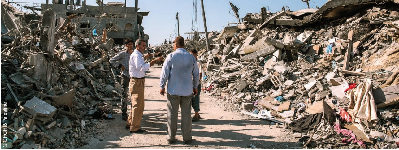
OHCHR colleagues interviewing the population in Gaza after the July conflict.

were cited by Member States, UN and human rights mechanisms, civil society and the international media. Intergovernmental mechanisms, such as the OSCE and the Council of Europe, used the reports as reference in shaping their responses to the situation.