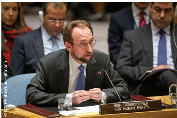
The High Commissioner addresses the Security Council meeting on the situation in Iraq, November 2014.

The European Agency for the Management of Operational Cooperation at the External Borders of the Member States of the European Union (Frontex) organized two training-of-trainer sessions on combating and preventing trafficking in human beings for border guards in the European Union