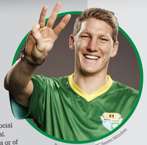
Bastian Schweinsteiger, FC Bayern München

There is hardly a societal activity that reaches more people than football. In Sub-Saharan Africa in particular, national teams are the pride of nations and their star players national celebrities and role models for millions, above all for children and adolescents. In 2010, with the first World Cup in Africa, football stars will be more in the spotlight and stronger role models than ever. WASH United works with African and international football stars to promote safe drinking water, sanitation and hygiene for all. The stars join our club and become Champions for WASH. Football-based tool-kits and games will harness the power of the game to facilitate life-saving behaviour change.