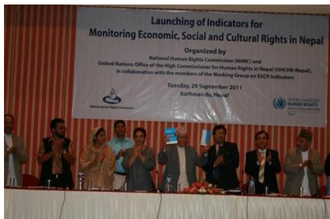
NHRC Chairperson launching the User's Guide

On 20 September, the National Human Rights Commission and OHCHR-Nepal launched A User's Guide containing indicators for selected economic, social and cultural rights (ESCR) in Nepal. Based on the OHCHR framework and developed by the Working Group on ESCR Indicators, which also included National Women Commission, National Dalit Commission, Ministry of Health and Population and Community Self-Reliance Centre, the indicators are expected to serve as a tool for the national stakeholders to monitor progressive realisation of the rights to adequate food, adequate housing, health, education and work. The Government's National Human Rights Action Plan (2010), which outlines national human rights priorities for the next three years, has already integrated some of these indicators.