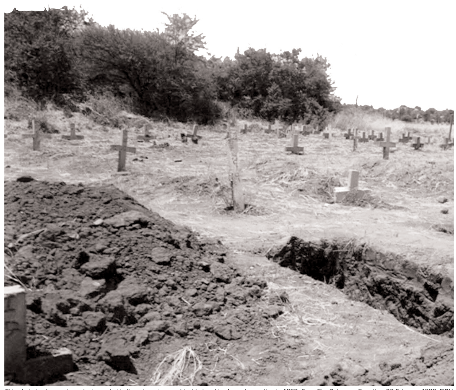
This photo is of one prisoner's grave, dug in the prison graveyard just before his planned execution in 1999.