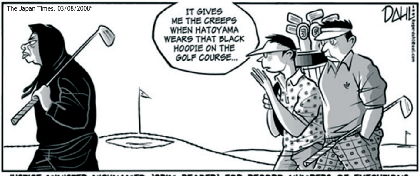
JUSTICE MINISTER NICKNAMED 'GRIM REAPER' FOR RECORD NUMBERS OF EXECUTIONS

Minister Hatoyama is fully aware of international pressure but insists on Japan's sovereign right to decide its own standards of justice. Two days after the United Nations resolution of 18 December 2007 calling for a universal moratorium on the death penalty, the Minister, aware of the ensuing debate, signed off on the execution of three individuals. Adding to three executions in February, four in April and another three in June, Japan's rate of execution under Minister Hatoyama has risen to three to four executions every two months. Moreover, according to information gathered from Amnesty International, the Minister has misled Parliamentarians of Japan's lower house, claiming that the 27 European Union ambassadors with which he had met had expressed «understanding» of Japan's stance on this issue.