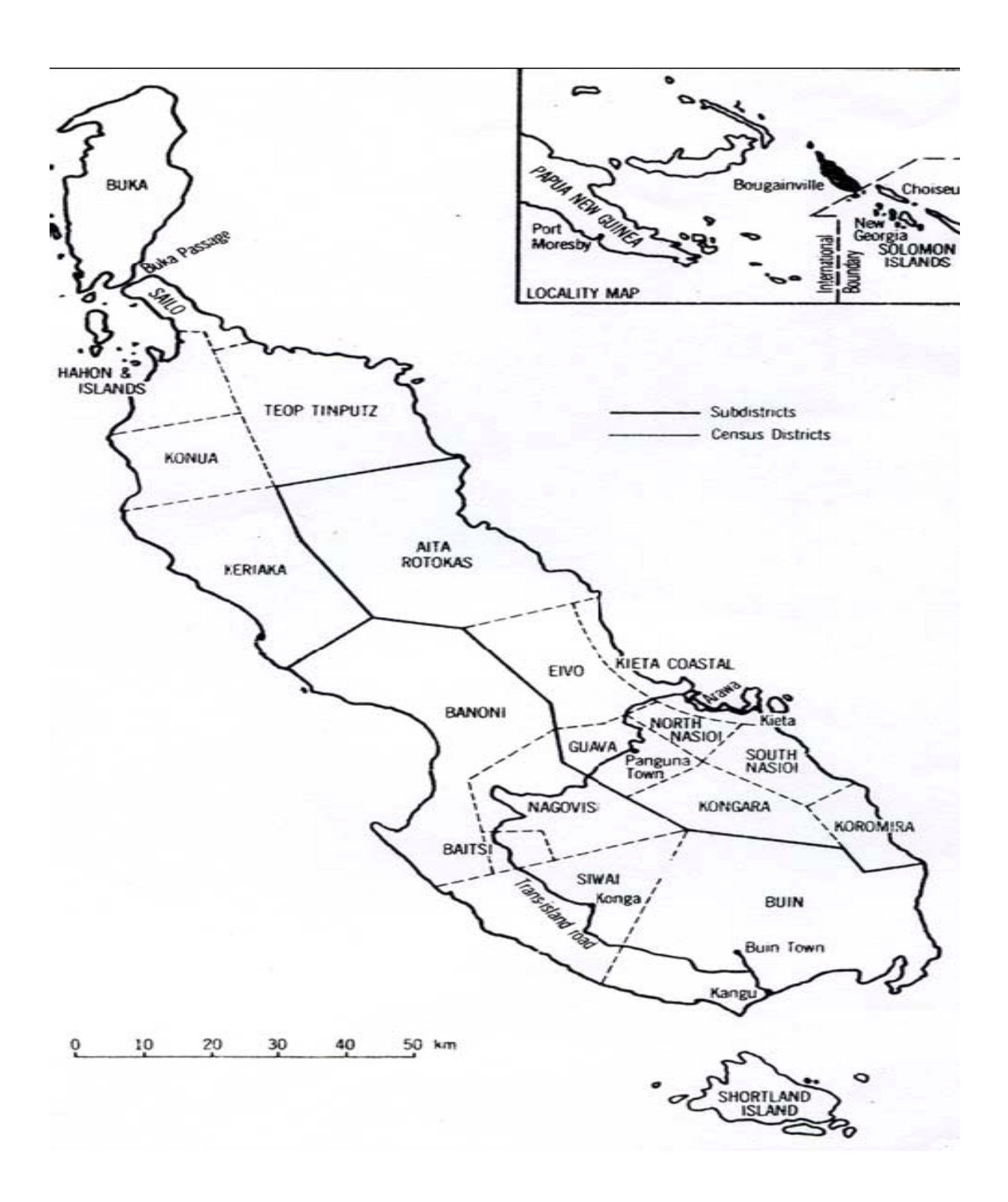
PART B – Autonomous Region of Bougainville