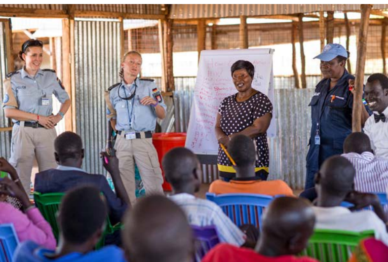
Training on sexual and gender-based violence in Juba conducted by UNPOL and the Human Rights Division of the United Nations Mission in South Sudan.