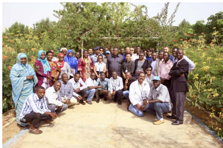
Staff members of the Human Rights Section of the African Union-United Nations Hybrid Operation in Darfur hold a planning meeting in El Geneina, August 2016.

The Independent Expert on the situation of human rights in the Sudan undertook one visit, in April, dur-