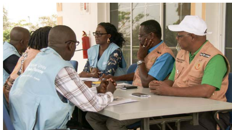
Coordination meeting between OHCHR staff members and African Union human rights observers.

Since April 2015, substantial progress has been made in setting up a permanent committee for drafting reports and following up on recommendations issued by the international human rights mechanisms. The 23 members of the Committee, who come from relevant ministries, have benefited from various OHCHR capacity-building sessions, which contributed to