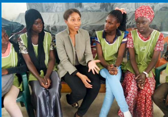
Awareness-raising activity with members of the CEM Les Martyrs High School.

The West Africa Regional Office (WARO) has partnered with a human rights club for young people in Senegal. Several years ago, WARO began building a strong relationship with the CEM Les Martyrs high school of Thi-aroie, based in the suburbs (25 kilometres from Dakar), which has 1,900 students. One teacher took on the challenge of creating the human rights club that WARO has supported since its inception, in December 2014. The Club Citoyenneté et Droits de l'Homme (Citizenship and Human Rights Club) of CEM Les Martyrs started out with 20 active student members and it now has a membership of 90 individuals who have demonstrated their great commitment to human rights promotion. This is even visible on the walls of their school where a painting is hanging that is dedicated to human rights.