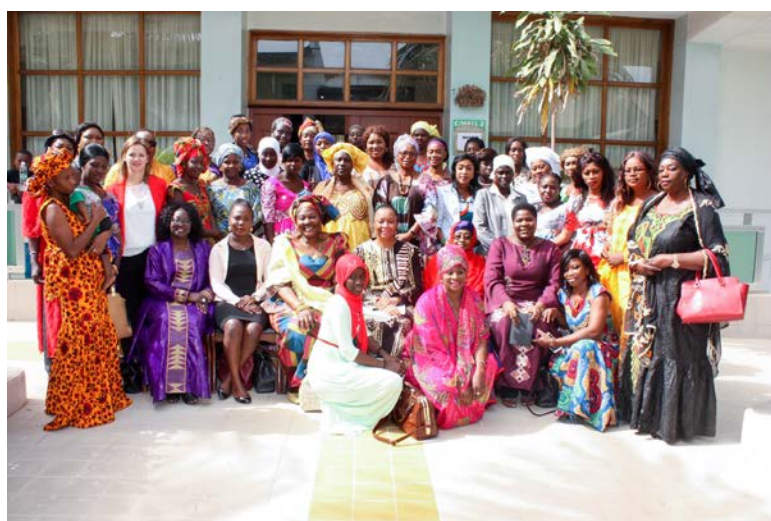
Participants of a workshop for aspiring female candidates of the National Assembly Election in the Gambia.

UPR and treaty bodies recommendations relevant to Senegal in the context of the UNDAF evaluation. The Regional Office also interacted with the Peer Support Group of the Regional UNDG for West and Central Africa in the context of the programming process of CCA/UNDAF roll-out countries in the region, including Burkina Faso and Ghana. These steps were taken in order to ensure the integration of a human rights-based approach in the strategic documents.