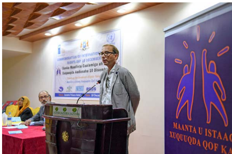
An OHCHR staff member addresses participants during a ceremony to commemorate Human Rights Day in Mogadishu, Somalia, December 2016.

After years of negotiations, the Somali Media Bill was adopted in January. The bill guarantees certain freedoms, including the independence of public broadcasting, protects the right to information for journalists and prohibits censorship or forced reporting on issues that are considered contrary to the public interest. It also outlines certain prohibitions of what can be reported on, including broadcasting false reports, inciting hostilities and disseminating baseless propaganda. Nevertheless, there are concerns that the lack of clarity of some terms in the bill could lead to subjective interpretations and the application of undue restrictions or limitations on the right to freedom of expression. Furthermore, the Media Law provides for the imposition of high penalties