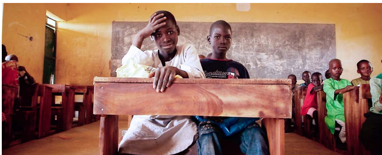
Students at a classroom in North East Nigeria.

With support from the Human Rights Adviser (HRA), a concept note was adopted on strengthening the operations of the Interministerial Working Group as a standing national body for reporting and follow-up to recommendations.