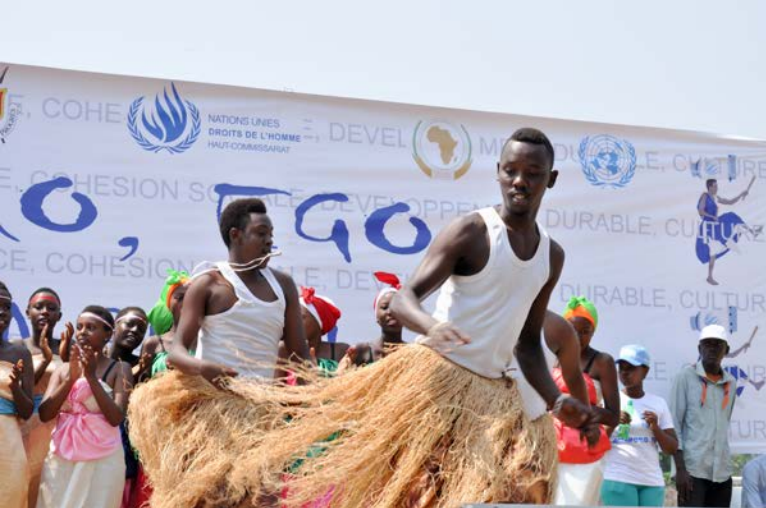
Cultural activity organized in the context of the "Amahoro, ego!" campaign.

the adoption of a road map to effectively fulfil the mandate of the Committee. OHCHR also provided technical and financial support for the creation of a documentation centre, within the Ministry of Human Rights, to provide the Committee members with working space and research tools. Since its establishment, the Committee has prepared two reports to two of the human rights treaty bodies, including one to the Committee on the Rights of the Child.