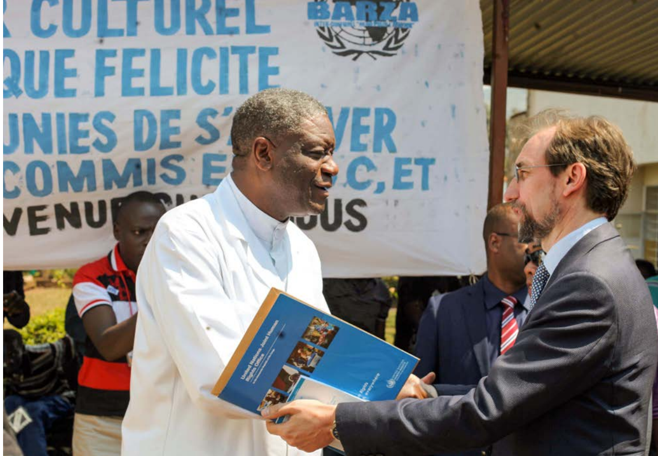
The High Commissioner met with Dr. Denis Mukwege, Director of the Panzi Hospital, during his visit to the Democratic Republic of the Congo.

international crimes to the Penal Code, abolishes immunity for officials, including the President and Members of Parliament, provides that there can be no amnesty for international crimes and contains provisions strengthening the cooperation of the DRC with the International Criminal Court. The legislation does, however, provide that the death penalty may be imposed for war crimes, crimes against humanity and genocide. In July, the President promulgated two presidential orders for pardons and the reduction of sentences, which included the commutation of death sentences to 20 years imprisonment.