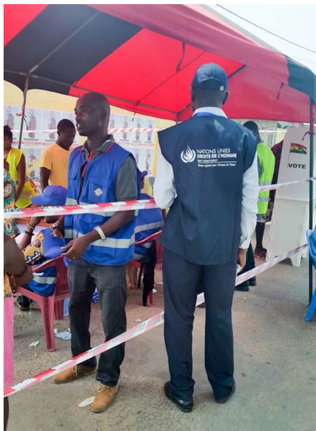
OHCHR staff member monitors elections in Ghana, December 2016.

In Burkina Faso, the Regional Office participated in the annual evaluation of the United Nations Development Assistance Framework (UNDAF) and provided information on the latest recommendations issued by the international human rights mechanisms in relation to Burkina Faso, in view of the preparation of the new Common Country Assessment (CCA)/UNDAF. Similarly, in Senegal, OHCHR also provided information with regard to the implementation of