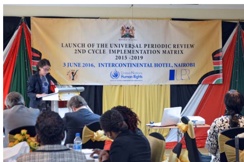
Discussion with national stakeholders in Kenya on the implementation of Universal Periodic Review recommendations.

In July, the HRA trained a group of 30 women human rights defenders from across the country on the hu-