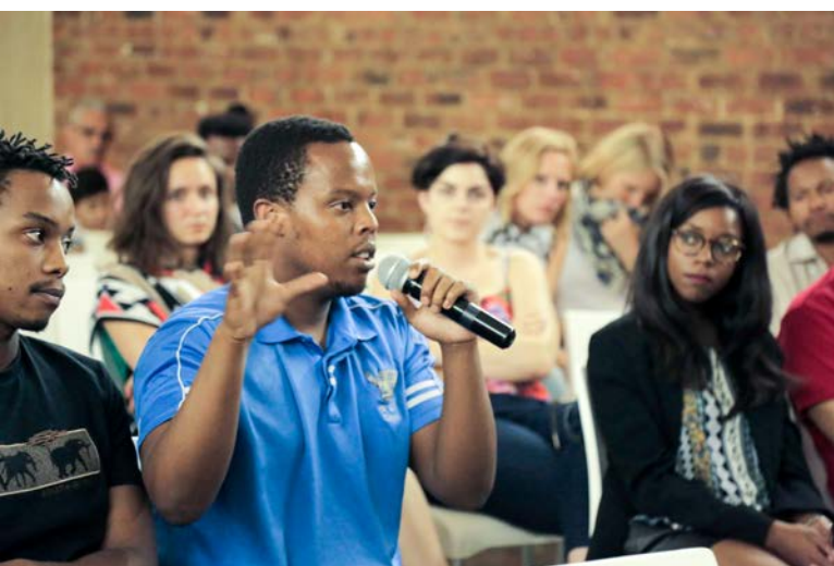
Panel discussion during a film festival organized by OHCHR, IOM and UNIC to celebrate Human Rights Day in South Africa.

The Government of Botswana announced that it is working on legislation to establish a national human rights institution, which will be submitted for review to the Parliament, in 2017. Although the Human Rights Commission Act of Lesotho was adopted in January, the institution has not been established, primarily due to a pending court challenge that was initiated by civil society. The Regional Office provided inputs to the draft legislation.