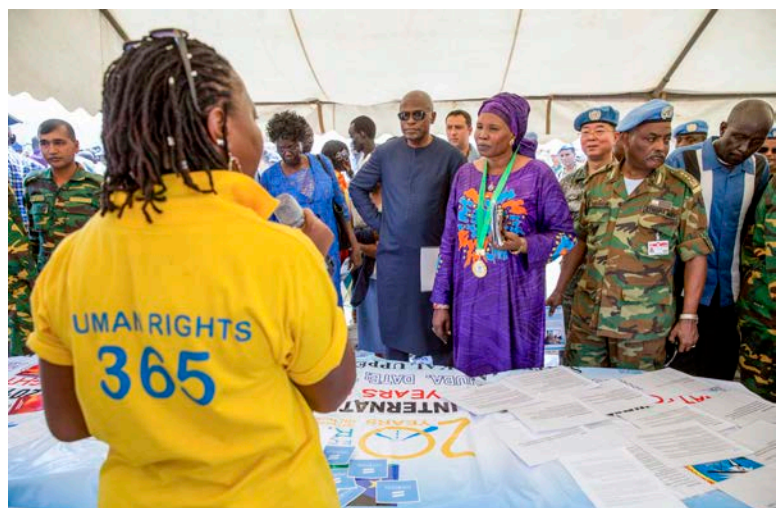
Awareness-raising activities in Juba, South Sudan.

South Sudan has not ratified the Second Optional Protocol to the International Covenant on Civil and Political Rights. There is no official moratorium on the death penalty and death sentences continue to be imposed. The HRD has engaged with national authorities on the ratification of the Second Optional Protocol to ICCPR and, through its monitoring work, documented cases where death sentences were imposed.