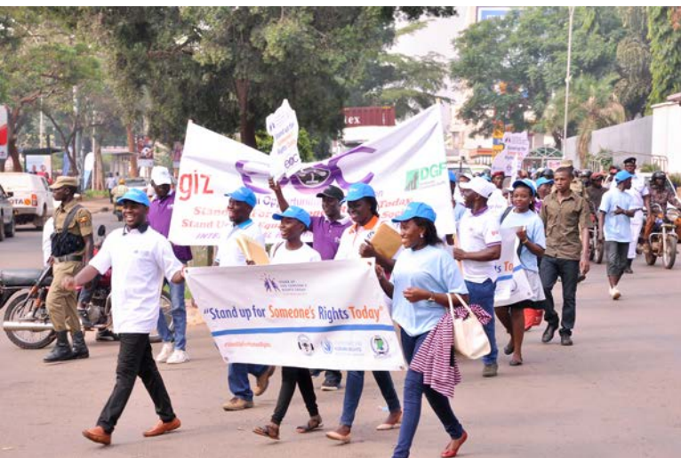
Human Rights Day celebration in Uganda.