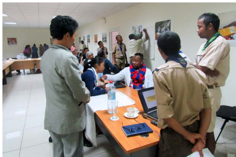
Human rights training workshop for civil society representatives in Madagascar.

Following OHCHR training events, 68 participants from civil society, local authorities, security forces, private security companies and representatives