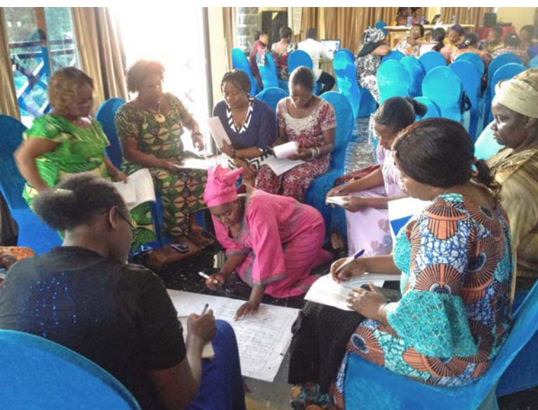
Workshop on women's participation in peace negotiations for women leaders, politicians and local authorities in Goma, Democratic Republic of the Congo, November 2016.

The United Nations Integrated Peacebuilding Office in Guinea-Bissau (UNIOGBIS) developed two practical guides on human rights for civil society and for military personnel, respectively. The latter was launched on the national day of the armed forces, in November, during which the Minister of Defence pledged to integrate the content of the guide into the Military Training Centre's curriculum for 2017. UN-