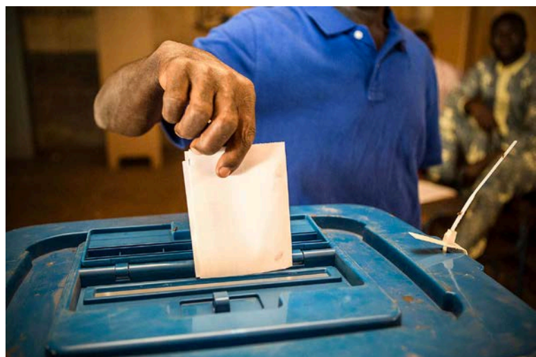
A voter casts his ballot at a polling station during local elections in Bamako, Mali, November 2016.

In March, the Human Rights and Protection Division (HRPD) of the United Nations Multidimensional Inte-