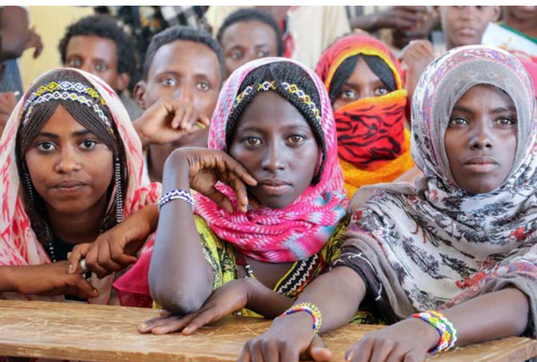
Population affected by the drought in Ethiopia.

cal persons in different ministries, the Parliament and other government offices, with a view to enhancing the functioning of the new reporting and follow-up arrangements in Ethiopia.