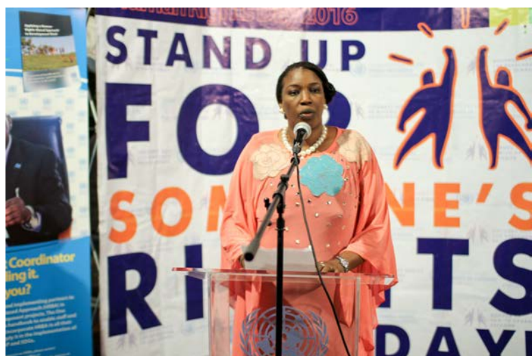
The Chairperson of the Rwanda Human Rights Commission addresses the audience during Human Rights Day celebrations in Rwanda.

The Human Rights Adviser (HRA), in collaboration with the Rwanda Civil Society Coalition on Universal Periodic Review, organized a three-day workshop focusing on follow-up and the implementation of the recommendations made in relation to Rwanda in the context of the UPR.