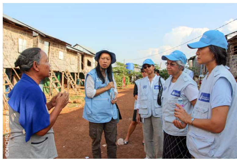
The Deputy High Commissioner speaks to community members while visiting a resettlement site in Oudong, Cambodia, May 2014.

► The High Commissioner and the Deputy ensured the integration of a gender perspective in their work. Specifically, the Deputy High Commissioner ensured that the composition of interview panels in OHCHR respected gender policies.