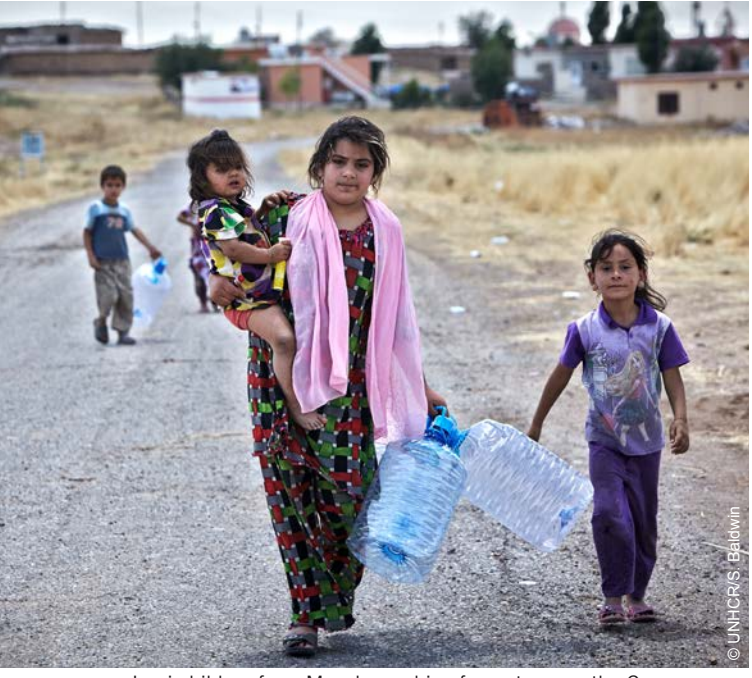
Iraqi children from Mosul searching for water near the Garmava temporary camp.

the participation of a wide range of experts and organizations, including NGOs. Through incountry technical assistance provided by RRDD and OHCHR field presences, indicators were identified to measure the realization of civil, economic, political and social rights, through different participatory processes, in a number of countries, including Côte d'Ivoire, Egypt, Morocco, Togo and Uzbekistan.