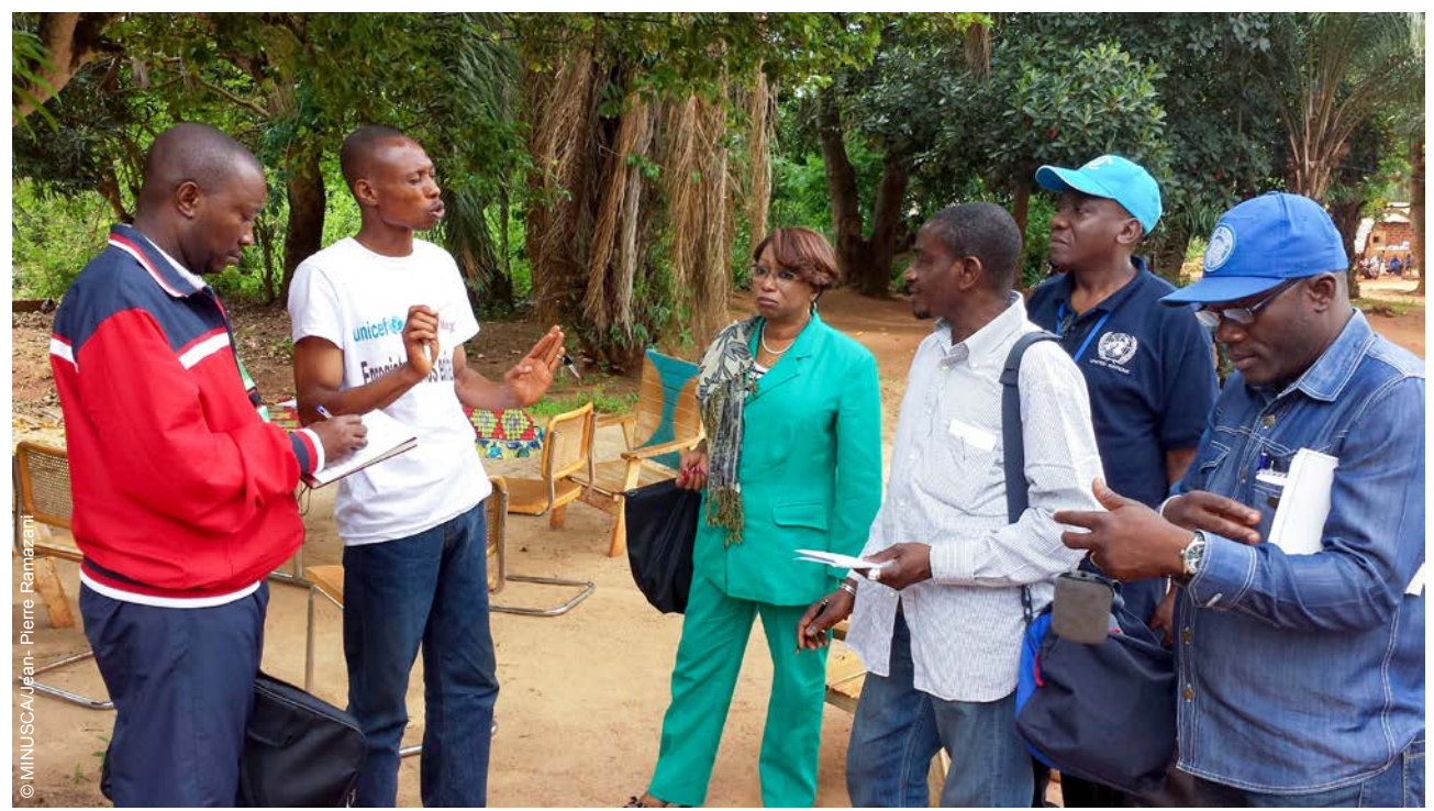
The Independent Expert on the situation of human rights in the Central African Republic, supported by OHCHR staff, visits Bangassou, April 2014.

human rights protection systems; enhance and implement international human rights norms at the country level; and prevent and reduce human rights violations. In addition, the Division supports national-level follow-up action to recommendations issued by the international human rights system, including the human rights treaty bodies, special procedures and the Universal Periodic Review (UPR). Specifically, FOTCD, in cooperation with other parts of the Office, seeks to ensure that national authorities and civil society actors have the capacity to address human rights concerns and are well informed about international human rights standards and how to practically translate these standards into laws, regulations and policies. The objective of this work is to ensure that rights-holders are better empowered and protected. In 2014, the Division continued to assist with the establishment and/or strengthening of NHRIs in close cooperation with OHCHR's country and regional offices, human rights components of UN peace missions and human rights advisers, including through the provision of legal