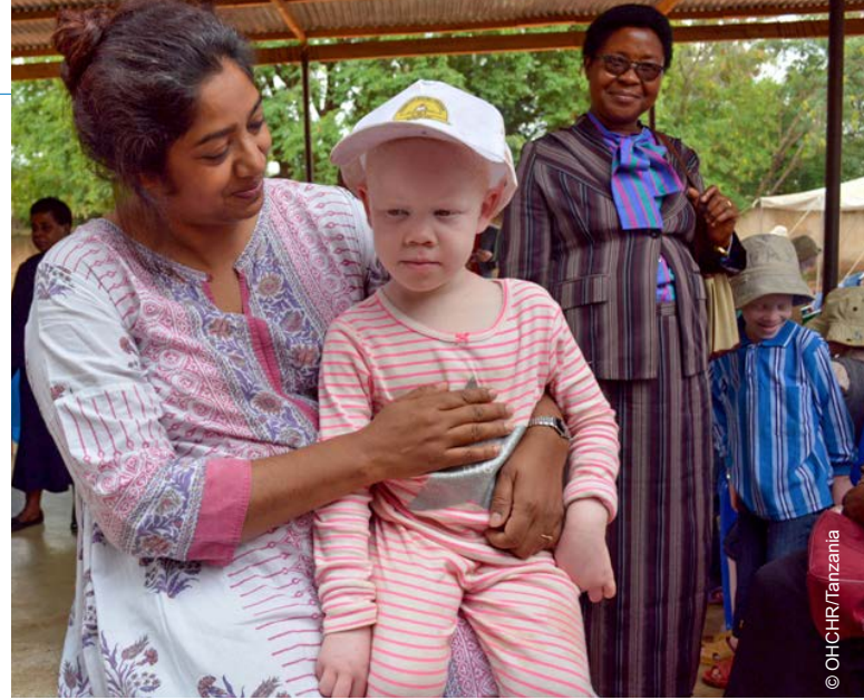
In 2014, OHCHR developed a campaign on the rights of albinos.