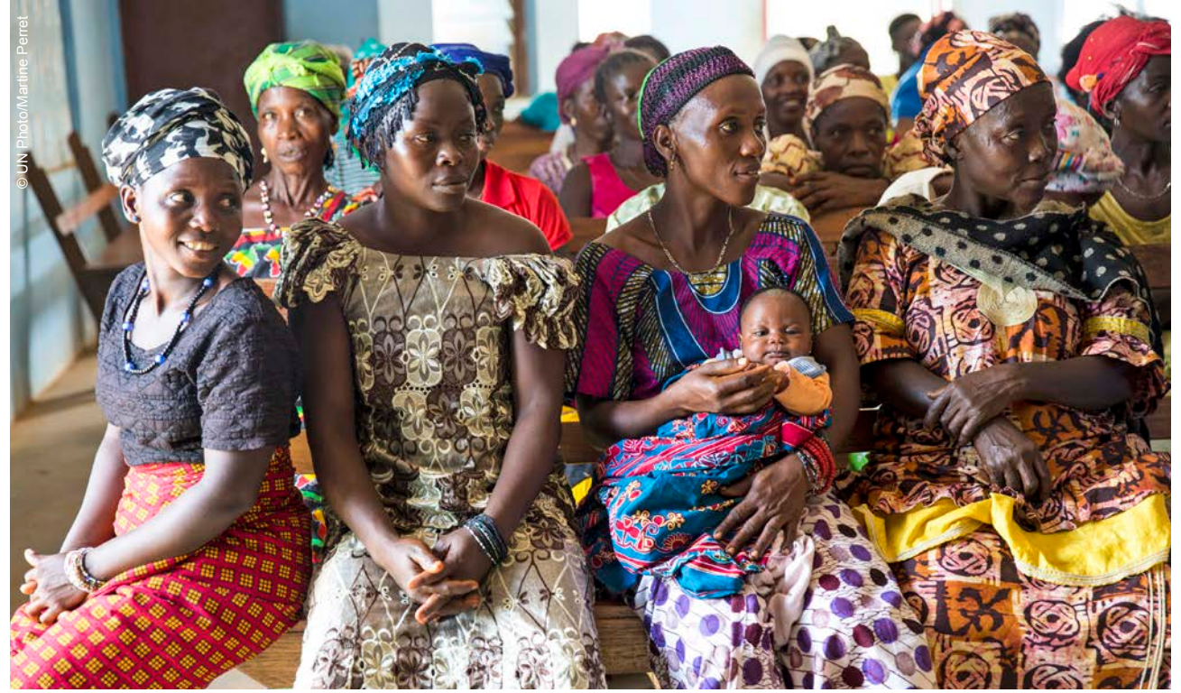
Community members in Freetown, Sierra Leone, attend a briefing on the Ebola virus disease outbreak.