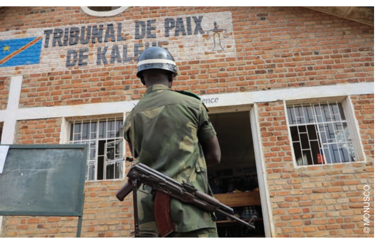
Tribunal of Kalehe, South Kivu, Democratic Republic of the Congo, where the trial of senior officers of the Congolese armed forces took place.

of the Child in relation to Tanzania and were raised during the review of the State Party reports of Burundi by the Human Rights Committee and of Swaziland by the Committee on the Elimination of Racial Discrimination. Finally, on the recommendation of the Human Rights Council,