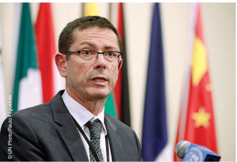
The Assistant Secretary-General for Human Rights briefs the press after attending a Security Council meeting on the human rights situation in Ukraine, May 2014.

national efforts to strengthen the efficacy of the justice sector to address sexual violence. Input was provided in relation to draft legislation on sexual violence in Colombia and Somalia and to the United Kingdom's International Protocol on the Documentation and Investigation of Sexual Violence in Conflict.