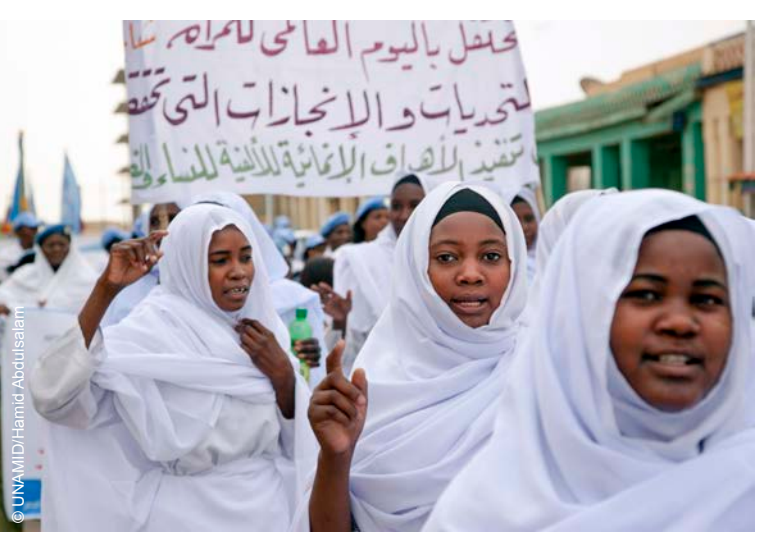
Celebration of International Women's Day in El Fasher, Sudan.

OHCHR staff, entitled Gender Equality, Human Rights and Me. As of December 2014, the training had been taken by 75 per cent of staff members. Moreover, according to staff self-assessments regarding their capacity to integrate gender into their work before and after taking the online course, the percentage of staff with a high capacity has more than doubled and is now at 92 per cent.