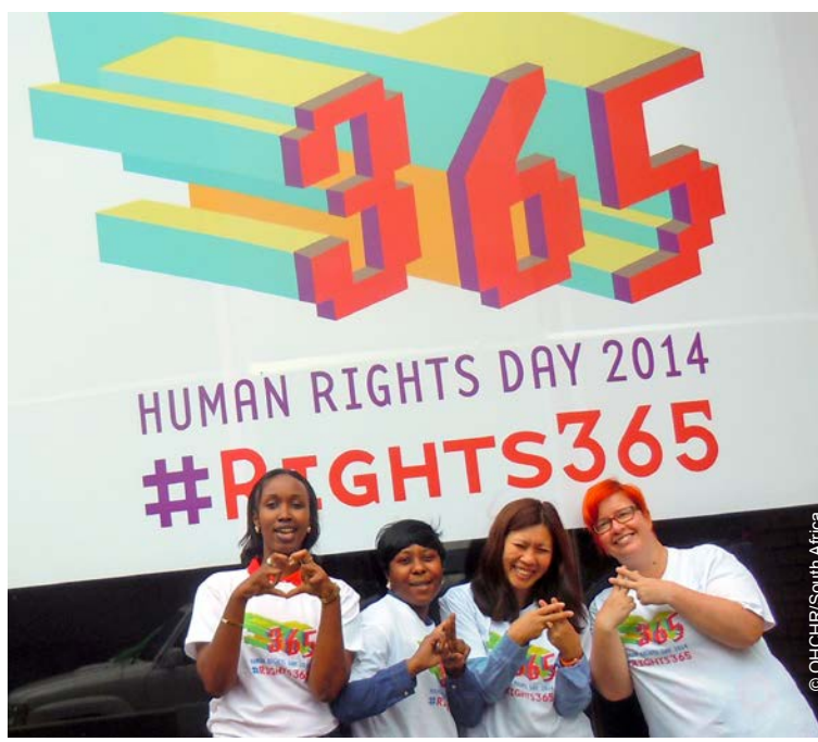
OHCHR staff of the Regional Office for Southern Africa commemorating Human Rights Day, December 2014.