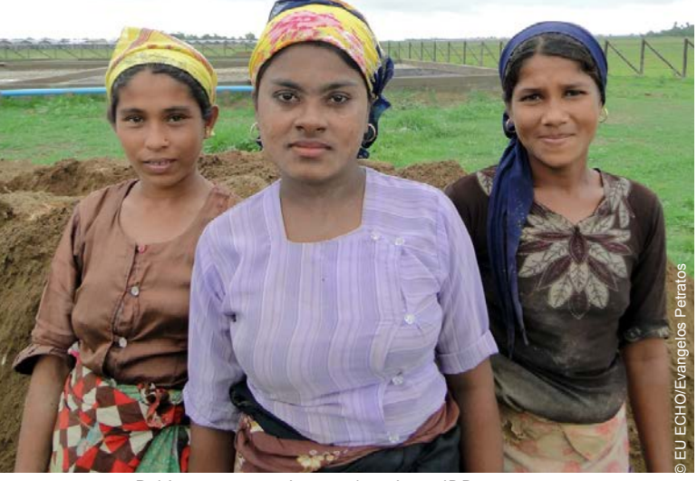
Rohingya community members in an IDP camp.

participated in the event, including representatives of governments, NHRIs and civil society, as well as international experts. A follow-up event will take place in piloting countries in the region, including in countries of the Gulf Cooperation Council and Iraq.