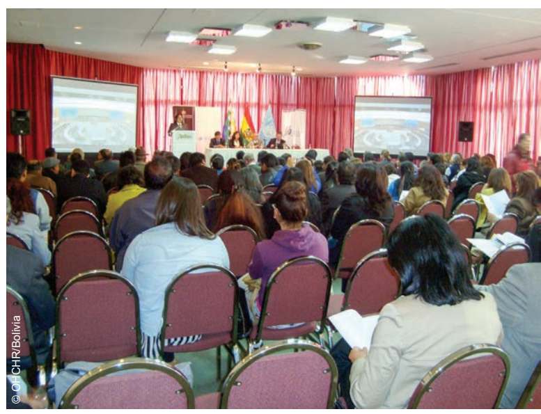
Webcast of Bolivia's second cycle Universal Periodic Review, October 2014.

In 2014, the Council held 25 panel discussions on subjects ranging from the rights of the child; women's human rights; gender-based violence and discrimination; protection of the family; the rights of indigenous peoples; the rights of persons with disabilities; the integration of a gender perspective; the role of prevention in the promotion and protection of human rights; civil society space; the rights of persons deprived of their liberty; history teaching and memorialization processes; the right to privacy in the digital age; the safety of journalists; the question of the death penalty; the prevention and punishment of the crime of genocide; the use of remotely piloted aircraft or armed drones in