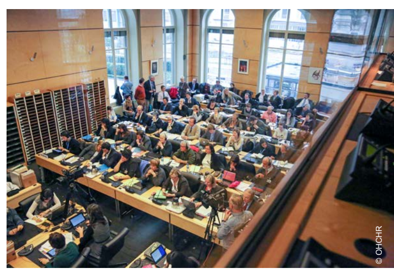
View of the room during the review of the report from the Holy See by the Committee on the Rights of the Child, January 2014.

OHCHR worked with a number of treaty bodies to issue statements on particular issues or in the context of specific situations. In 2014, CEDAW issued statements on the situation of women and girls in Iraq and Syria, the situation in Gaza, the abduction of Nigerian schoolgirls and the post-2015 development agenda. CRPD issued a number of statements, including a joint statement with the Special Rapporteur on the rights of persons with disabilities and the Special Envoy of the Secretary-General on Disability and Accessibility, a statement on disability inclusion in the Third World Conference on Disaster Risk