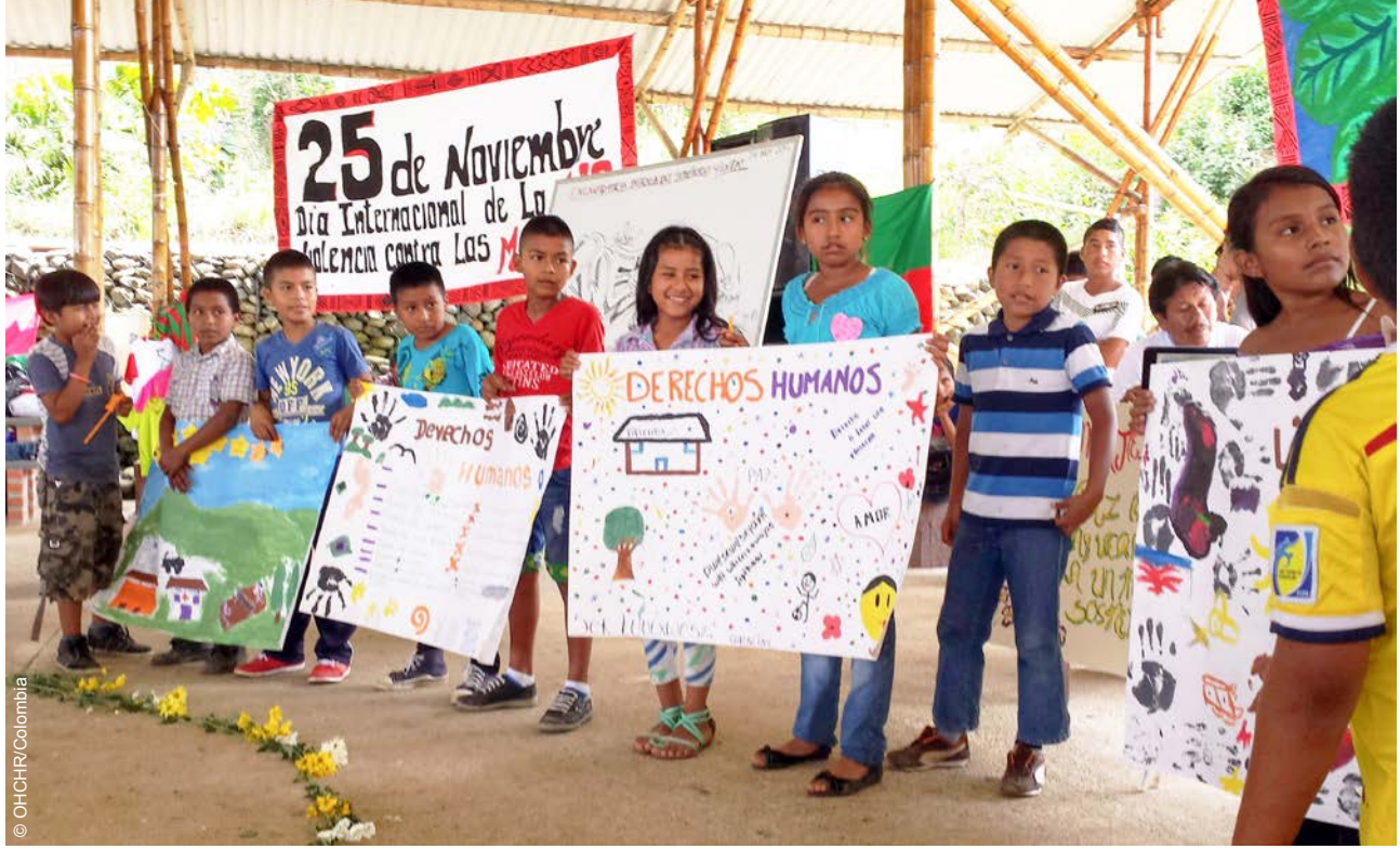
OHCHR activity with indigenous children in Colombia, November 2014.

former High Commissioner visited Georgia where, inter alia, she stressed that de facto authorities bear the responsibility to ensure protection in the context of a protracted conflict. She also offered OHCHR's assistance in contributing to this protection through increased monitoring. OHCHR's efforts to follow up the High Commissioner's 2011 mission to the Republic of Moldova, including to the Transnistrian region, resulted in the 2014 establishment of Transnistria's first system of alternative civilian service for conscientious objectors, as well as its first shelter for victims of domestic violence. The Office continued reporting on an annual basis to the Human Rights Council on the human rights situation in Cyprus and stressed that the division of the island continues to constitute an obstacle to the full enjoyment, by the entire population of Cyprus, of all human rights and fundamental freedoms. In the context of the crisis in the Central African Republic, the Office supported the Department for Peacekeeping Operations (DPKO) and the United Nations Multidimensional Integrated Stabilization Mission in the Central African Republic (MINUSCA) to ensure a robust human rights mandate. In planning processes for both MINUSCA and MINUSMA, the Office contributed to the development of indicators on the protection of civilians. The Office also contributed to Security Council briefings on the DRC, Iraq and South Sudan.