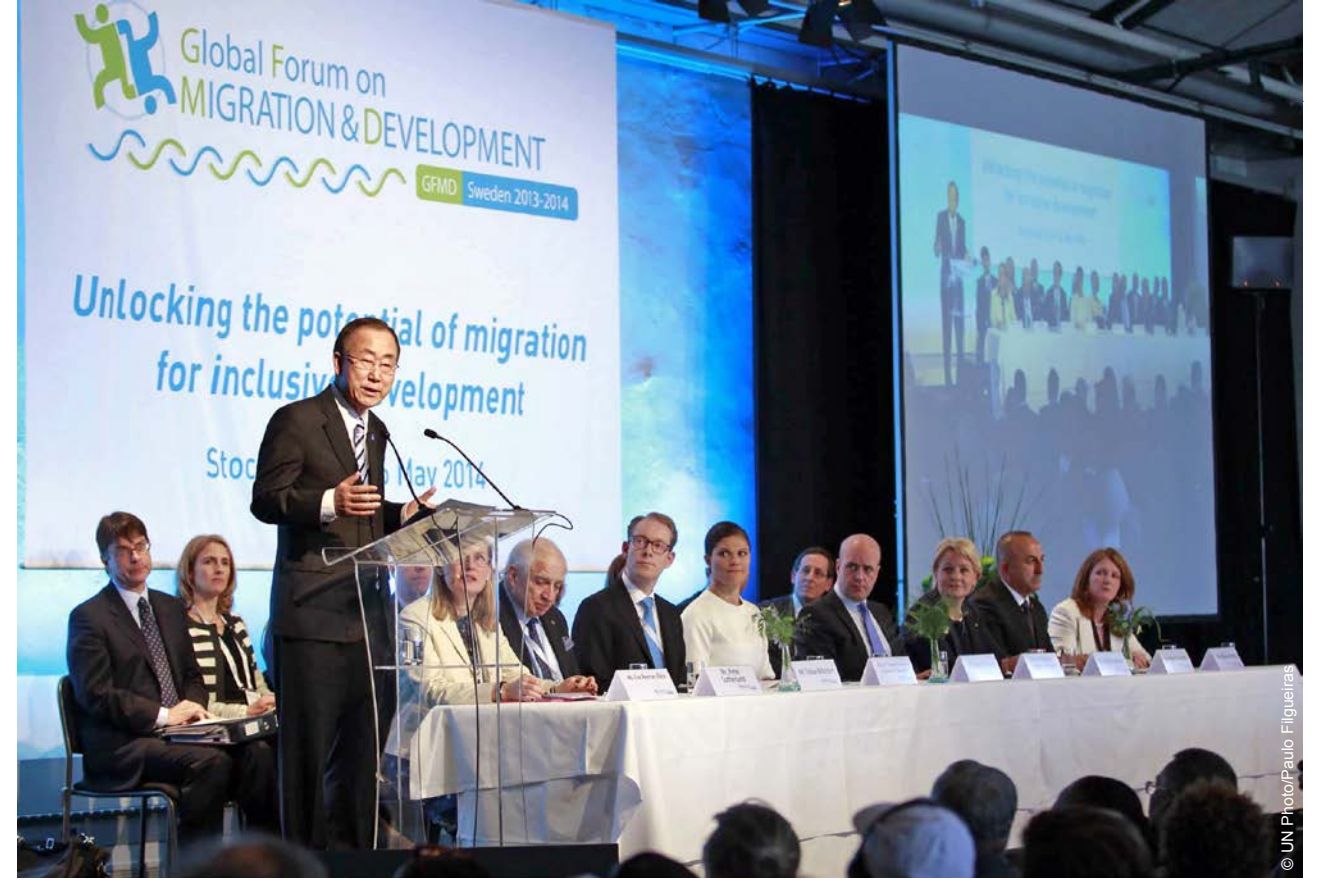
The Secretary-General addresses the opening of the Global Forum on Migration and Development in Stockholm, Sweden, May 2014.

surveillance practices. It also served as the basis for discussion at the expert panel convened at the 27th session of the HRC and directly informed the resolution on the right to privacy in the digital age, adopted by the General Assembly in November (A/C.3/69/L.26/Rev.1), which included a number of commitments by States and proposed measures for follow-up.