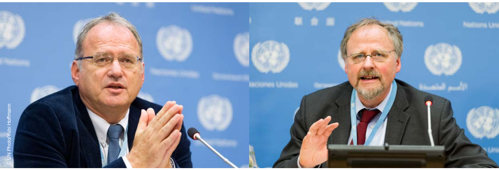
The Special Rapporteurs on extrajudicial, summary or arbitrary executions and on freedom of religion or belief, brief the press in New York, October 2014.