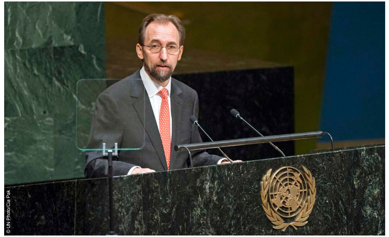
The High Commissioner speaking at the World Conference on Indigenous Peoples, September 2014.

The High Commissioner for Human Rights continued global advocacy for the promotion and protection of human rights by encouraging concrete partnerships between relevant stakeholders, building on the Office's expertise, at headquarters and in the field, and working to bring alleged violations to the fore and seeking their prevention.