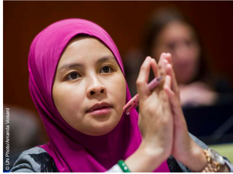
A young participant at the interactive panel discussion organized in New York to mark the 25th anniversary of the Convention on the Rights of the Child, November 2014.

The recommendations of the treaty bodies are used in a wide variety of contexts in the work of the Office, including as background documentation