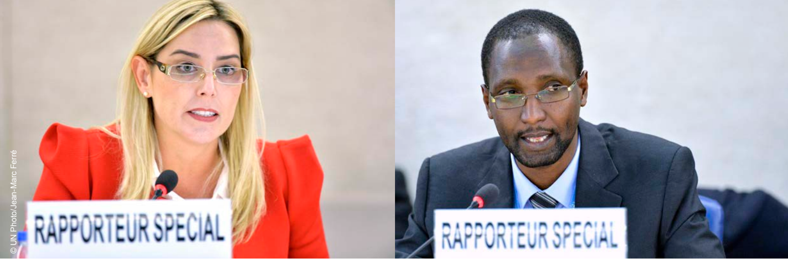
The Special Rapporteurs on the independence of judges and lawyers and on contemporary forms of racism, racial discrimination, xenophobia and related intolerance, brief the Human Rights Council during its 26th session, June 2014.

progressive development of international human rights law and standards.