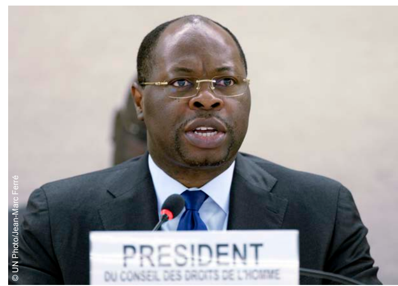
Baudelaire Ndong Ella, President of the Human Rights Council, addresses the opening of the Council's 26th session, June 2014.

In addition, the Council requested OHCHR to conduct an investigation into alleged serious violations of human rights by both parties in