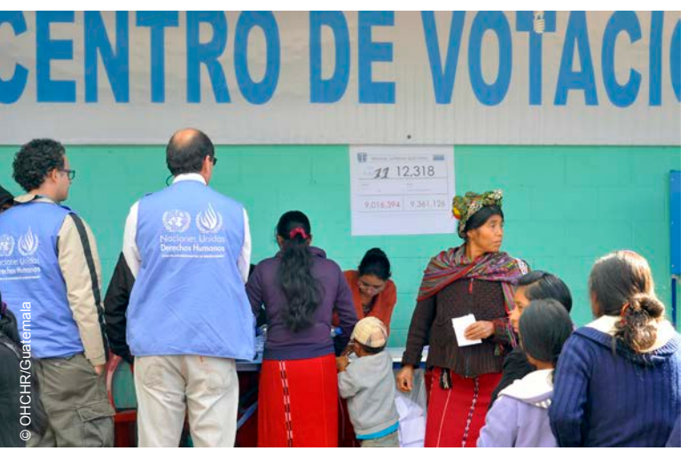
Human rights officers monitoring municipal elections in Nebaj, Guatemala.

advice and capacity-building. Cooperation between NHRIs and their networks and their engagement with the international human rights system was a priority area of work.