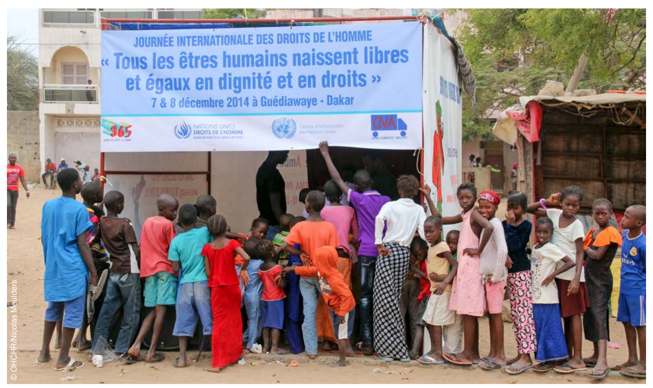
Awareness-raising event organized by the OHCHR Regional Office for West Africa to commemorate Human Rights Day.

The Division continued to deliver policy and operational support to field presences, including through guidance in relation to specific areas of fieldwork, such as technical cooperation