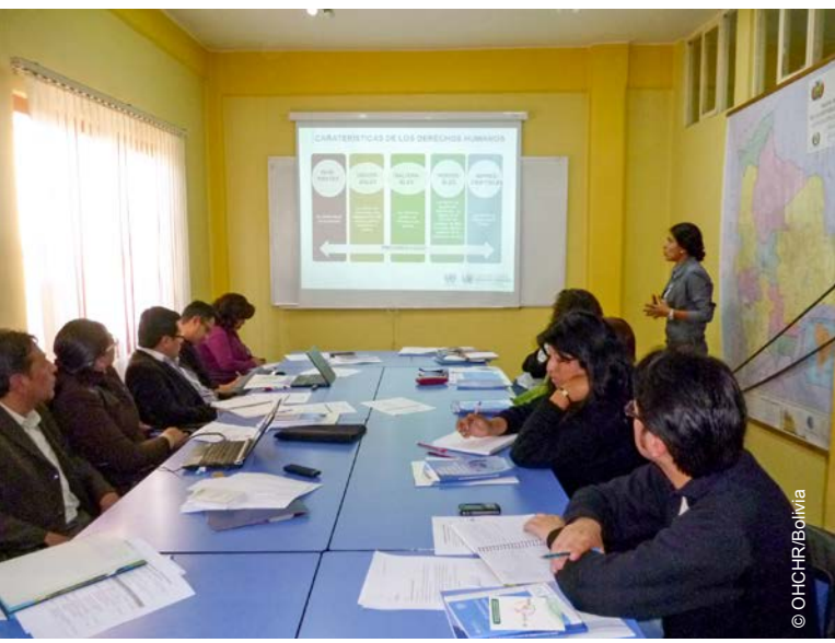
Workshop for the development of human rights indicators based on OHCHR's methodology in Bolivia, June 2014.

lessons-learned into guidance tools. In 2014, RRDD continued to lead OHCHR's work on the development of UN policies and their followup. In addition, the Human Rights Up Front (HRUF) initiative required considerable OHCHR participation.