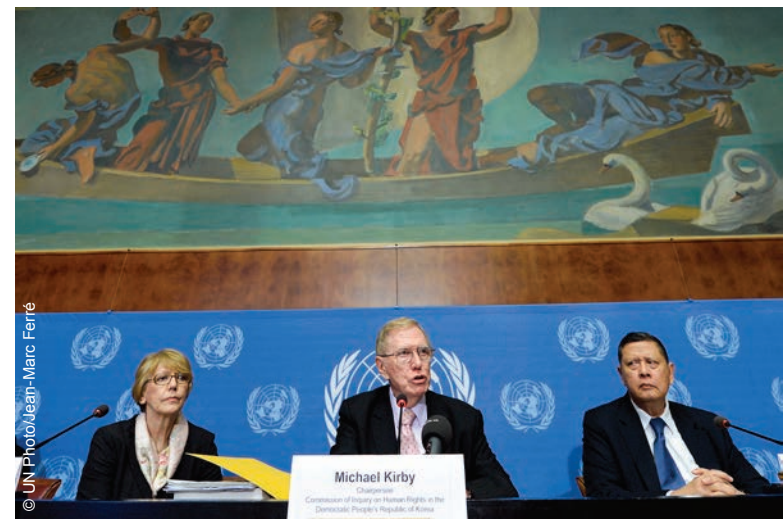
Members of the Commission of Inquiry on Human Rights in the Democratic People's Republic of Korea at a press conference after the presentation of the Commission's report to the Human Rights Council, March 2014.

In 2014, OHCHR continued its work in the context of protracted conflicts in Europe, including through continued participation in the Geneva International Discussions. In May, the