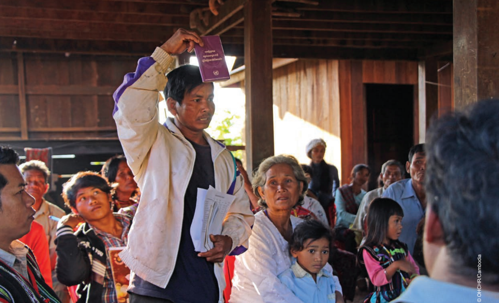
An indigenous people representative holding up a copy of the UN Declaration on the Rights of Indigenous Peoples during a meeting with OHCHR and other UN agencies in Cambodia to discuss land issues.