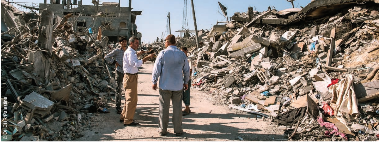
OHCHR colleagues interviewing the population in Gaza after the July conflict.

were cited by Member States, UN and human rights mechanisms, civil society and the international media. Intergovernmental mechanisms, such as the OSCE and the Council of Europe, used the reports as reference in shaping their responses to the situation.