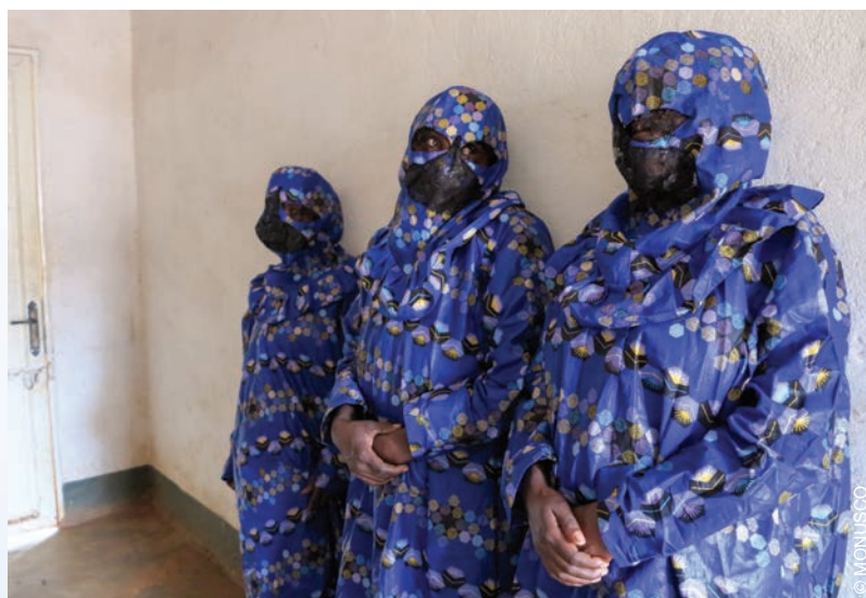
Witnesses in the trial against senior officers of the Congolese armed forces.

One of the biggest challenges for the UNJHRO has been setting up a mechanism that will enable victims and witnesses to access justice without fear of retaliation. Without adequate protection measures, the civilian population, which is still vulnerable and often exposed to violence, often feels that the price to pay is too high for testifying against a former member of an