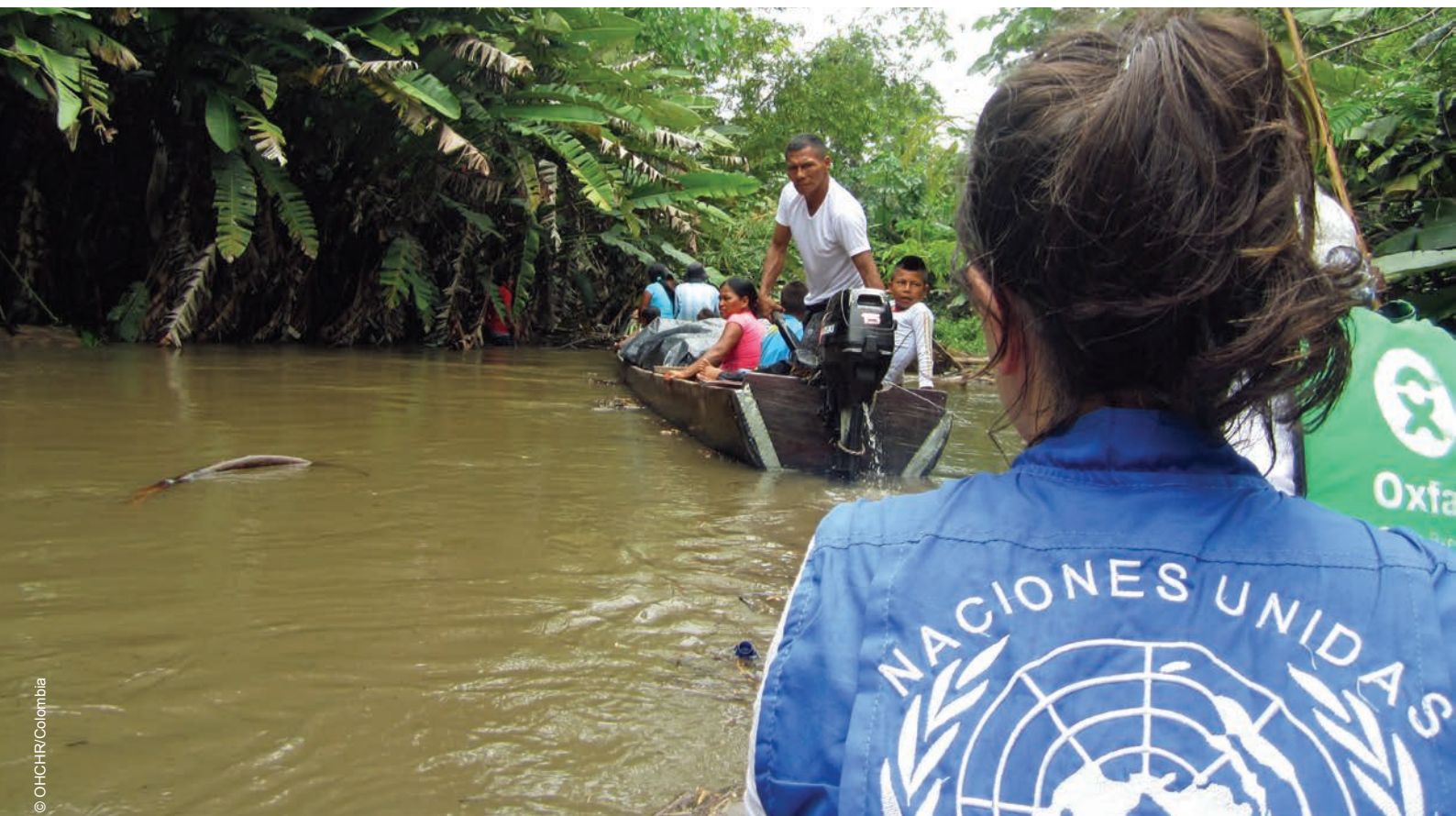
OHCHR staff on mission to Chocó, Colombia.

This section highlights results, or progress made towards results, which were recorded in 2014 and to which OHCHR made a meaningful contribution. For a general overview of OHCHR's role in these developments, please refer to the end of the chapter; page 36. For a more detailed description of the results and OHCHR's specific role, please refer to the chapters by field presence and headquarter division which can be found on the CD attached to this report or on our website.