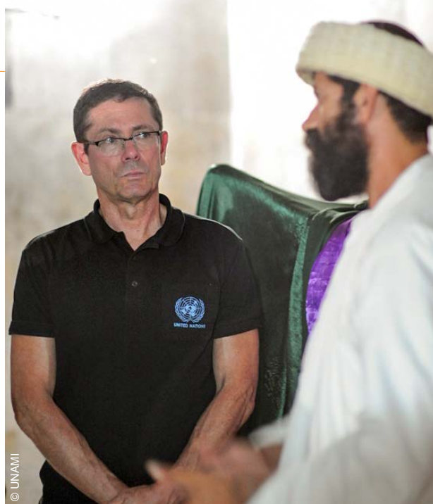
The Assistant Secretary-General for Human Rights during his visit to refugee camps in Iraq, October 2014.

OHCHR contributed to the results outlined above through extensive advocacy with government partners and CSOs, facilitating discussions and obtaining agreed solutions. More specifically, it engaged in advocacy to encourage States to comply with international standards; provided advice on the drafting of laws and policies; submitted legal briefs to the judiciary, where applicable; and undertook research and methodology for the elaboration and implementation of indicators. It provided technical assistance to indigenous communities on claiming and obtaining their rights and translated human rights materials for local populations. In the course of its work, OHCHR