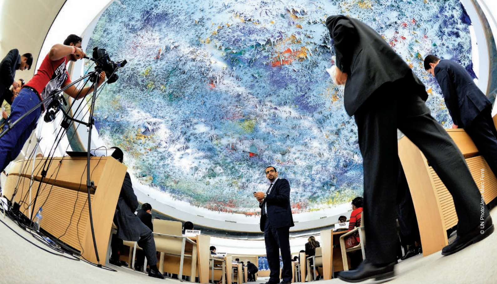
A view of room XX during the 25th session of the Human Rights Council, March 2014.

Civil society organizations in Cambodia made eight submissions to the Human Rights Committee. In the Maldives , CSOs and the national human rights institution submitted a total of six stakeholder reports for the second cycle of the UPR. A coalition of CSOs in Kuwait submitted a report to the UPR and a number of NGOs in Mauritania submitted a joint report to the CEDAW Committee.