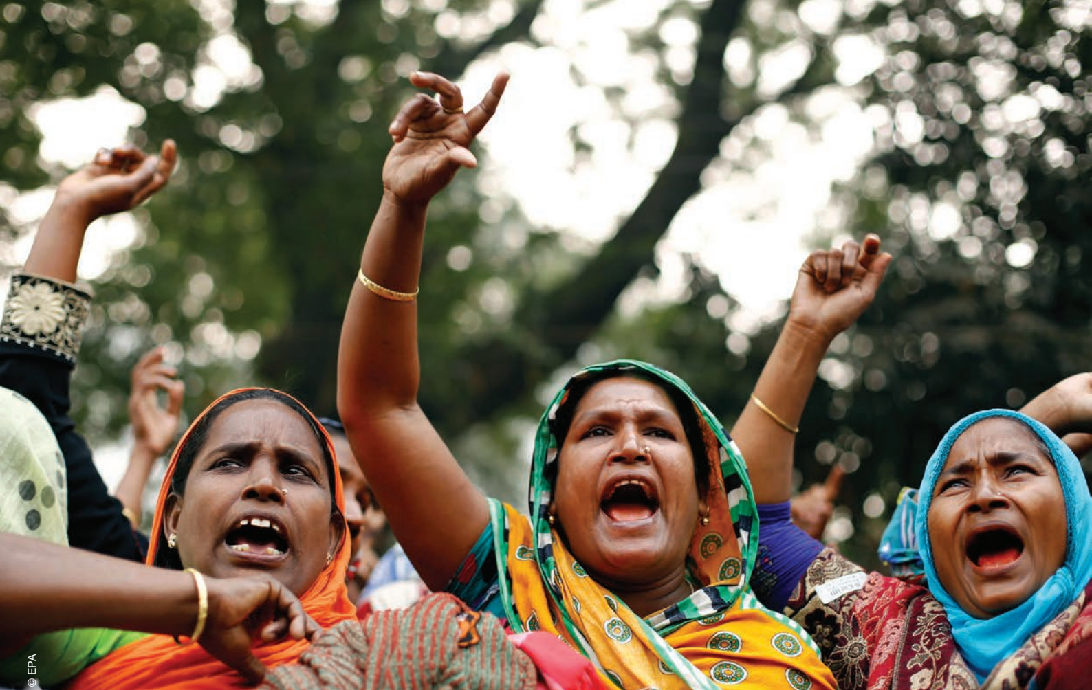
Protestors during a demonstration in Dhaka, Bangladesh.