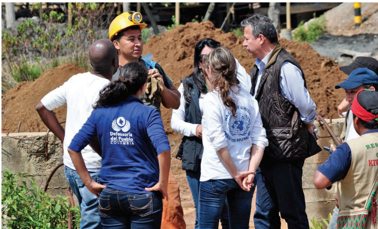
OHCHR staff during a monitoring mission with the Ombudsman's Office and the Indigenous Guard to a mining site in Cauca, Colombia.

General Department of Cadastre and Geography. In April, three indigenous Suoy communities filed applications for communal land titles.