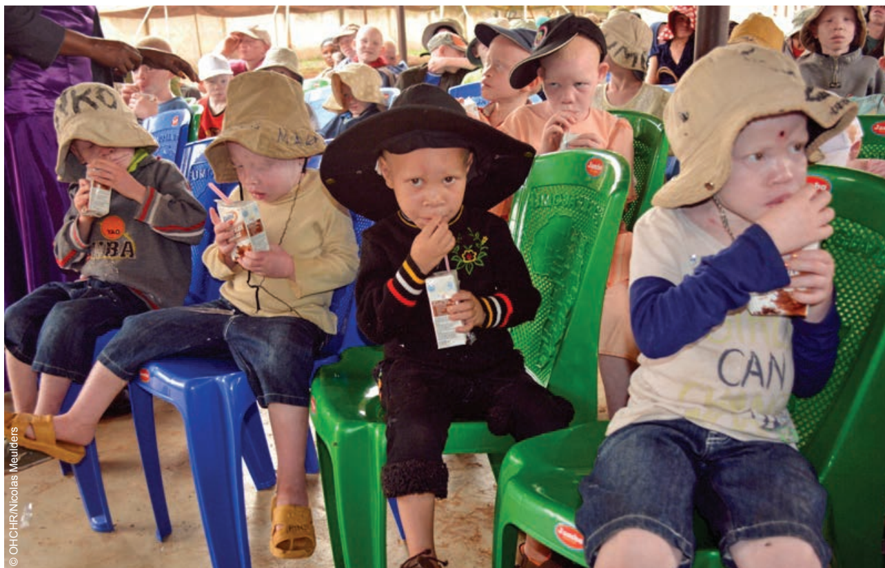
Children with albinism in the United Republic of Tanzania.

Haiti established an interministerial monitoring committee to ensure that the rights of persons with disabilities are taken into consideration in the development and implementation of public policies. The Office of the Secretary of State drafted two bills to this effect; one for the establishment of a solidarity fund and one for the amendment of the Labour Code. The draft bills have not been submitted to Parliament.