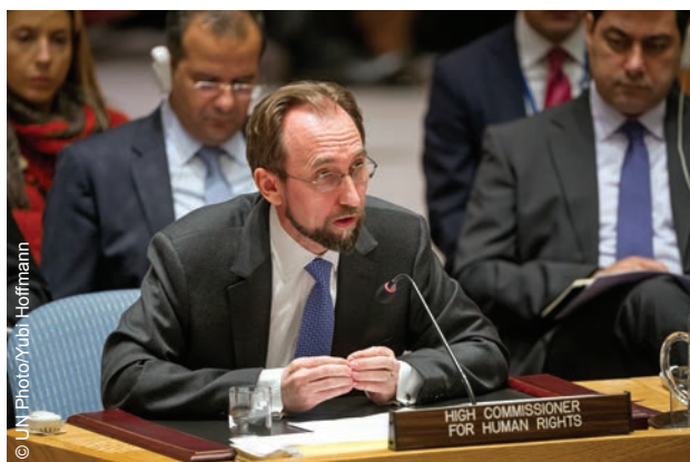
The High Commissioner addresses the Security Council meeting on the situation in Iraq, November 2014.

The European Agency for the Management of Operational Cooperation at the External Borders of the Member States of the European Union (Frontex) organized two training-of-trainer sessions on combating and preventing trafficking in human beings for border guards in the European Union