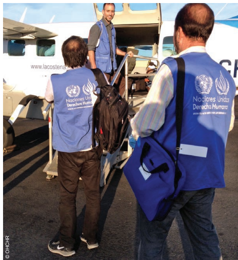
Members of the Subcommittee on Prevention of Torture and Other Cruel, Inhuman or Degrading Treatment or Punishment and OHCHR staff members visit Nicaragua, May 2014.

OHCHR works in close partnership with numerous stakeholders at the global, regional, national and local levels, both within and outside of the United Nations system. Many of these partnerships are of a strategic or operational nature and often involve collaboration between and the pooling of resources of relevant stakeholders with a shared interest in addressing specific human rights needs. Partners include Member States, NHRIs and CSOs at the international, national and local levels, the private sector, foundations, regional and international organizations, Secretariat departments and UN agencies, funds and programmes. In addition, the Office actively cooperates with the international human rights machinery to find effective ways to work together in order to address global human rights issues.