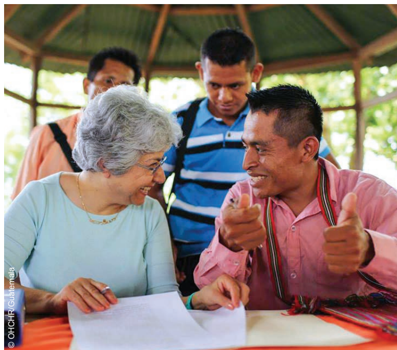
The Deputy High Commissioner visits indigenous communities involved in the Maya programme in Guatemala, May 2014.

the Human Rights Council, the General Assembly proclaimed 13 June as International Albinism Awareness Day.