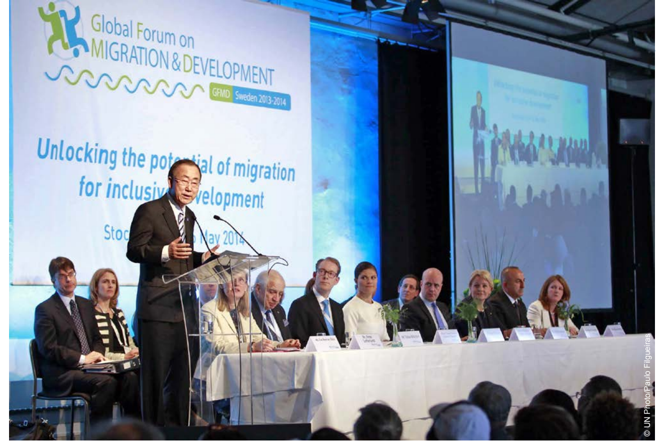
The Secretary-General addresses the opening of the Global Forum on Migration and Development in Stockholm, Sweden, May 2014.

surveillance practices. It also served as the basis for discussion at the expert panel convened at the 27th session of the HRC and directly informed the resolution on the right to privacy in the digital age, adopted by the General Assembly in November (A/C.3/69/L.26/Rev.1), which included a number of commitments by States and proposed measures for follow-up.