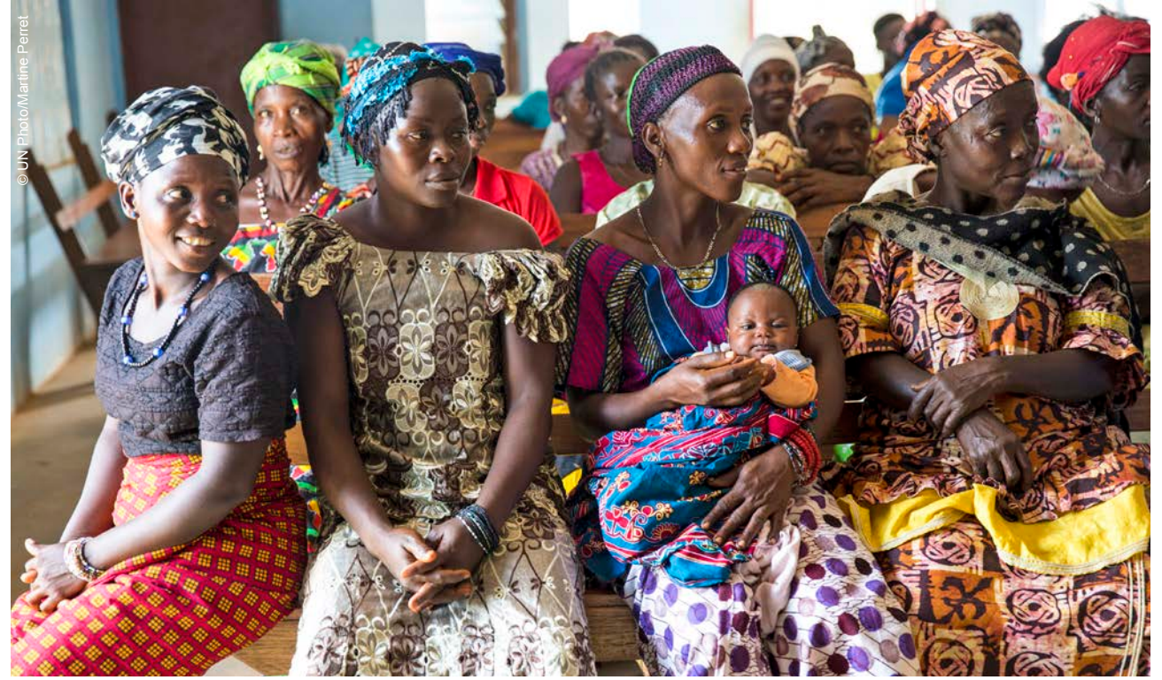
Community members in Freetown, Sierra Leone, attend a briefing on the Ebola virus disease outbreak.