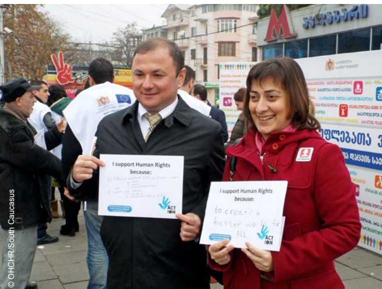
Human Rights Day event in Tbilisi, Georgia, jointly organized by the Human Rights Ombudsman, OHCHR, UNDP and the EU, December 2014.