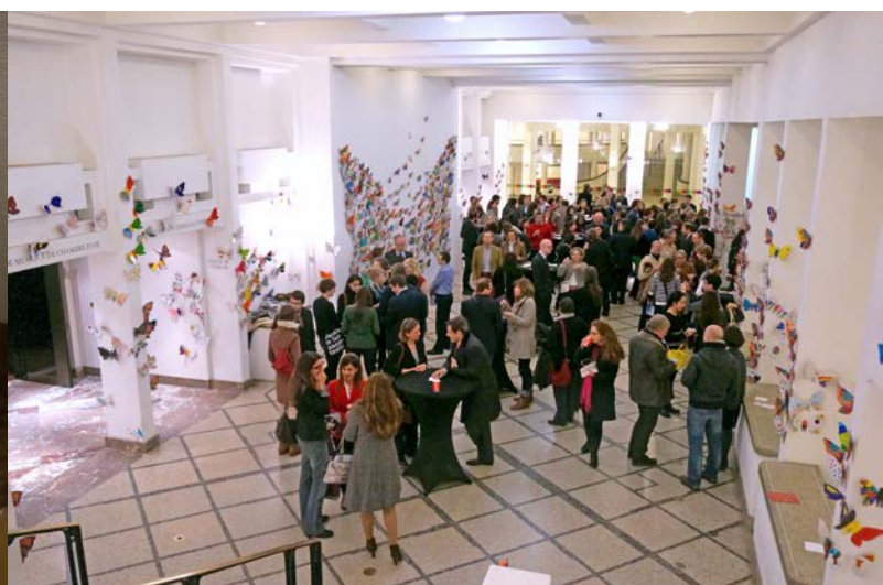
OHCHR participated at the UN Day in Brussels, October 2014.