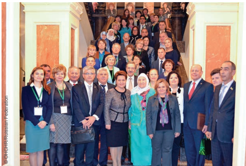
Participants of the International Forum of Muslim Women: Human Rights in Today's World supported by OHCHR.

With OHCHR support, five universities from Moscow, Perm and Kazan integrated the Human Rights Master Programme into their curricula. Negotiations for the inclusion of the Master Programme are underway with four other universities from Voronezh and Yekaterinburg regions. The core courses include lectures on the UN human rights system, the treaty bodies, international humanitarian and human rights law in conflict and post-conflict situations and the European system of human rights protection.