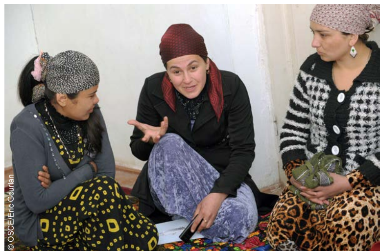
A group of women participate in a seminar on the prevention of domestic violence in Tajikistan, February 2014.

from the Office, the Government held nationwide consultations with civil society prior to the mid-June deadline for stakeholder submissions. The Coordination Council and a local NGO jointly organized the consultations in Bishkek and Osh, representing an encouraging sign of increased partnership between the State and civil society.