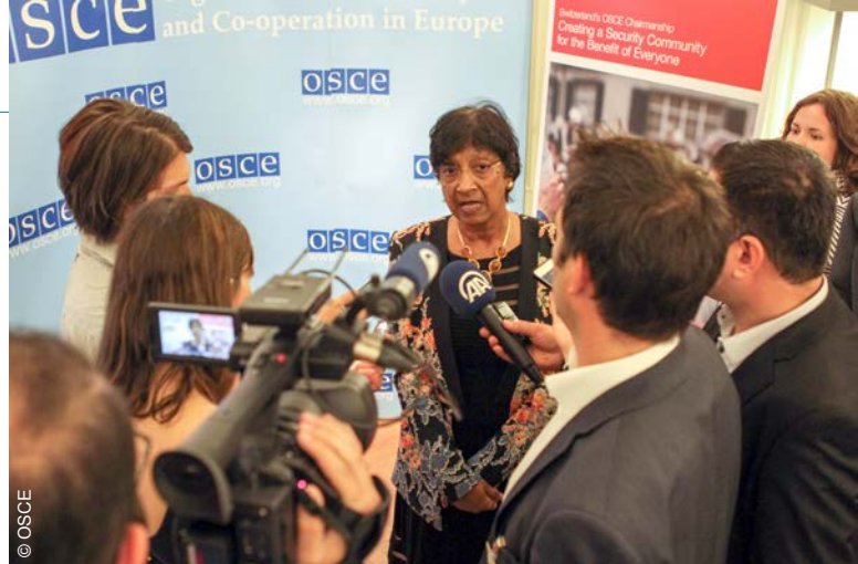
Former High Commissioner Navi Pillay speaking to the media after her address to the OSCE Permanent Council in Vienna, July 2014.

Progress was also achieved in enhancing the capacity of rights-holders and CSOs to participate in the design and monitoring of EU development policies. The European Commission's Directorate-General for International Cooperation and Development (DG DEVCO) elaborated its first toolkit on the practical implementation of a human rights-based approach to EU development programmes. DG DEVCO consulted with OHCHR, which provided inputs, as well as rights-holders and their representative organizations in the preparation of the toolkit.