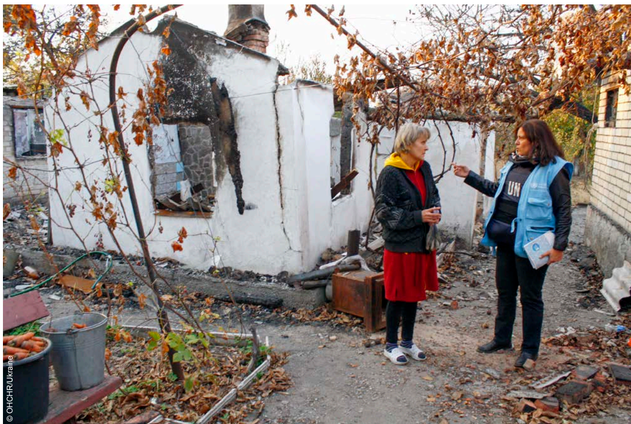
An OHCHR staff member during a monitoring mission to the Donetsk region, Ukraine.