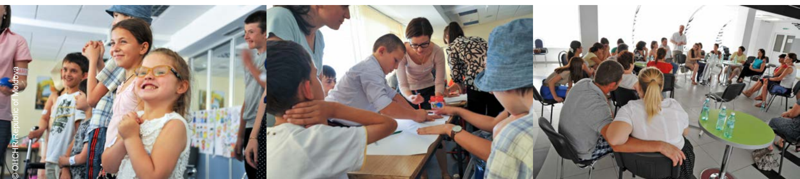
Activities carried out by OHCHR with a network of parents working to achieve inclusive education for children with disabilities in the Republic of Moldova.