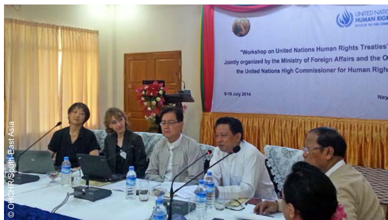
Workshop on human rights treaty bodies jointly organized by OHCHR, the Ministry of Foreign Affairs and the Ombudsman's Office in Myanmar, July 2014.