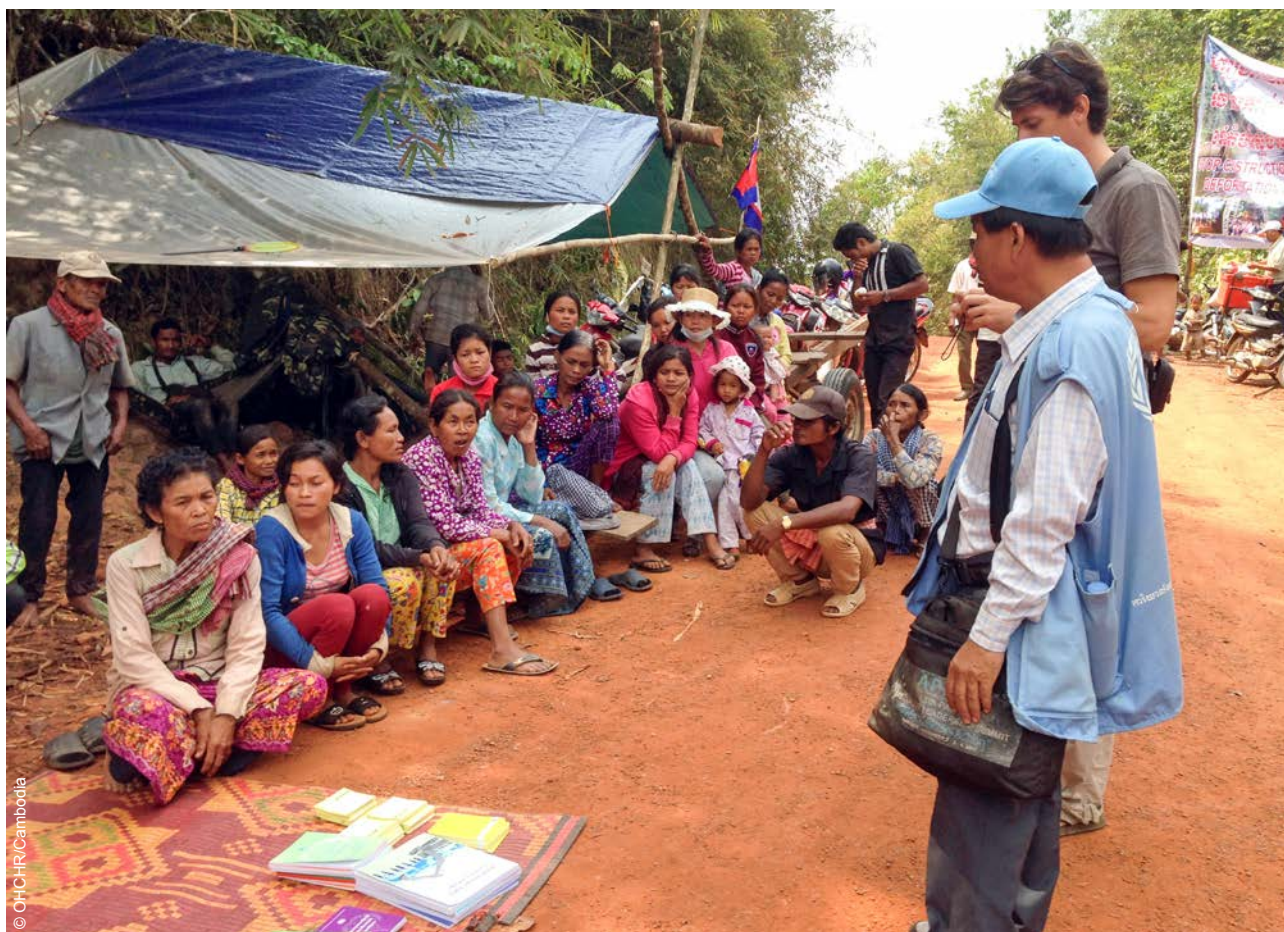
OHCHR staff members visit an indigenous group in Areng Valley, Koh Kong Province, Cambodia.

Prosecutor. The case was prosecuted and the relevant police officers were eventually found guilty, although on less serious charges. This is an important breakthrough which will hopefully lead to the prosecution of more cases.