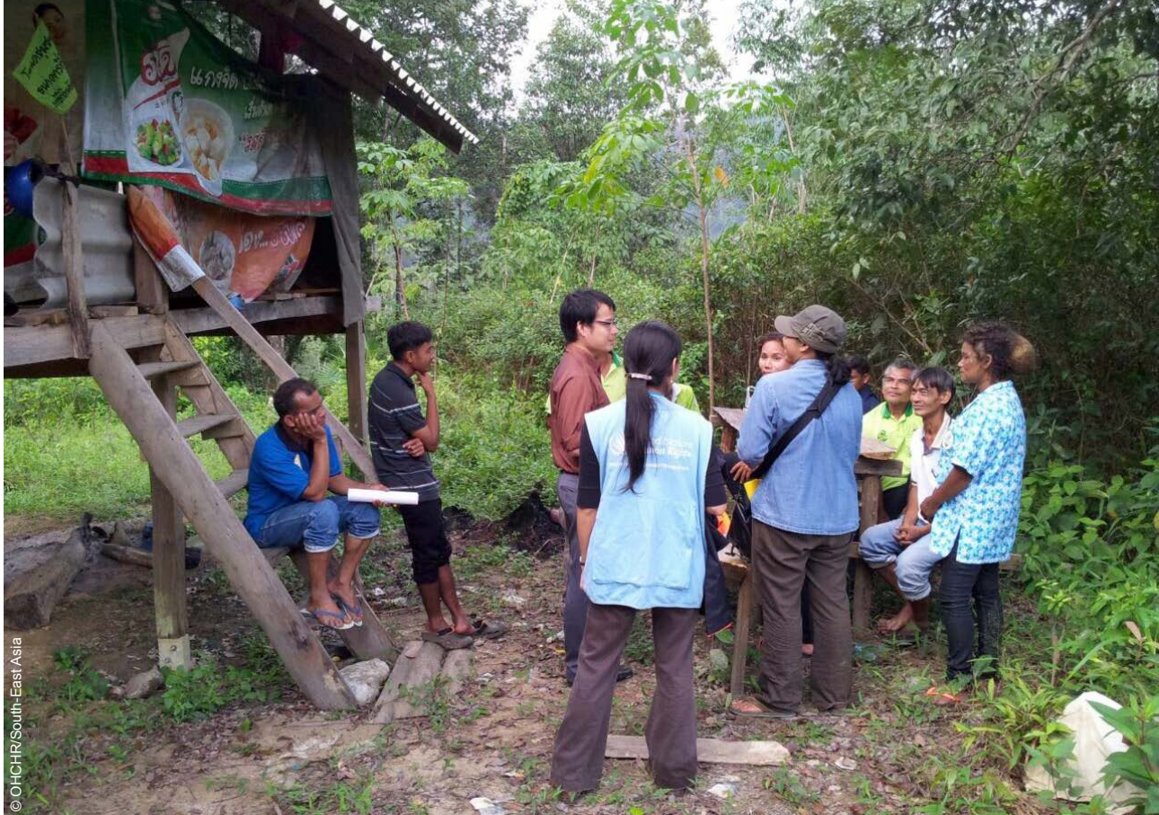
An OHCHR team visits a Trang community in Thailand to discuss their human rights in relation to land and housing, November 2014.