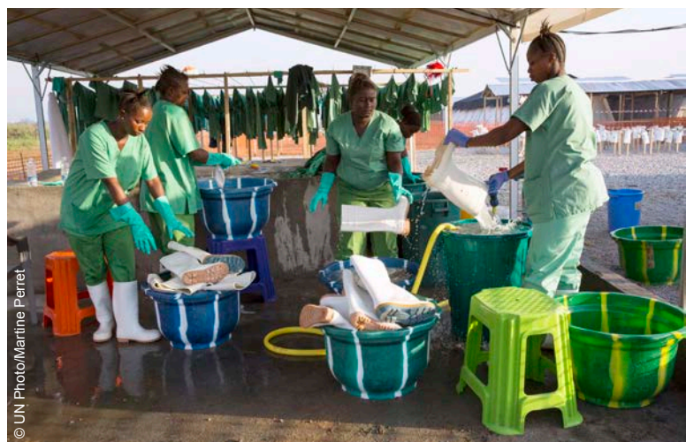
An Ebola treatment centre in Magburaka, Sierra Leone.