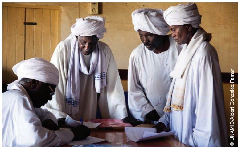
Participants at a workshop on human rights organized by UNAMID in El Fasher, North Darfur.

Due to these efforts, the overall participation rate of women and children increased to nearly 40 per cent. By the end of its term, the DTRC had collected 72,483 testimonies, 28,064 of which were from women and 757 of which were given by children.