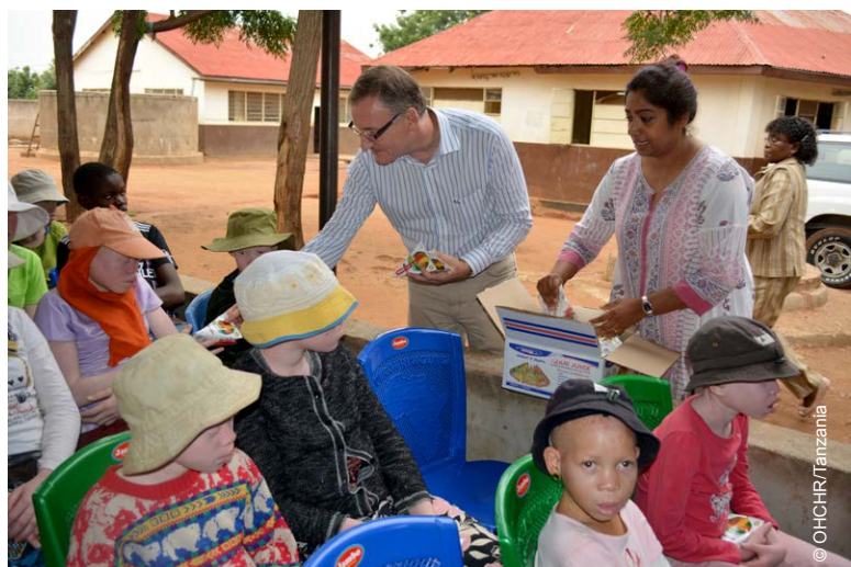
OHCHR outreach activity addressed to children with albinism in the United Republic of Tanzania.