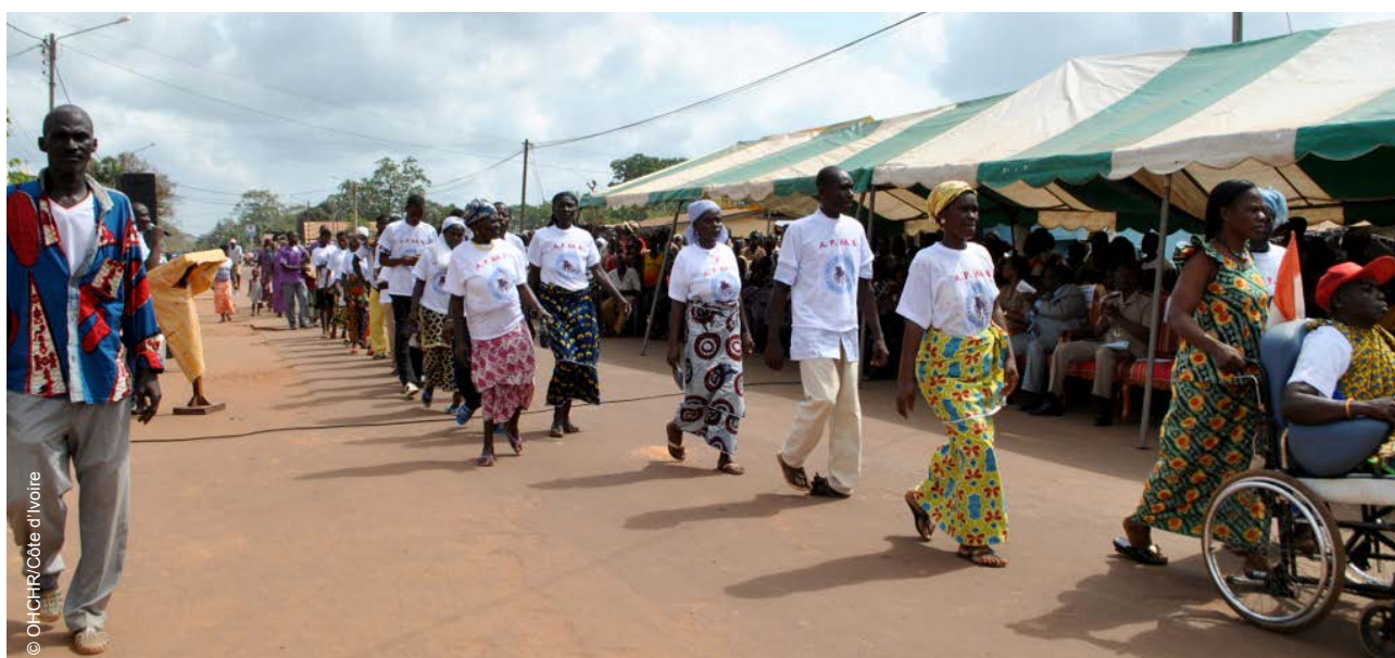
Commemoration of the International Day of Persons with Disabilities in Côte d'Ivoire, December 2014.