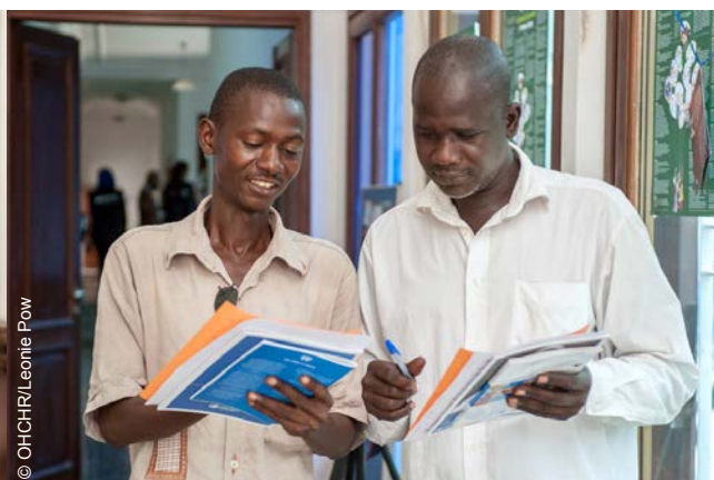
Images of awareness-raising events organized by the OHCHR Regional Office for West Africa.