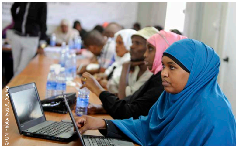
Participants at the national consultation workshop on the Post-transition Human Rights Road Map for Somalia facilitated by the United Nations Assistance Mission in Somalia, November 2014.

The Human Rights Commission Bill was submitted to Parliament in early December and later that month it was returned to the Committee on Human Rights and Women's Rights after passing a second reading. Some of the amended provisions are inconsistent with the Paris Principles and could compromise the independence of the Commission, particularly in the areas of financial autonomy and procedures for the appointment of Commissioners. The HRS provided consistent input to the Ministry of Human Rights on the draft. On 27 November, the Puntland Office of the Human Rights Defender (OHRD) was established, following the appointment by Parliament of the Human Rights Defender. Throughout 2014, the HRS advocated for the establishment of the Office and engaged with it once it was established. The HRS also organized a forum with civil society to discuss the roles and responsibilities of the OHRD as well as possible opportunities for civil society organizations to engage with it.