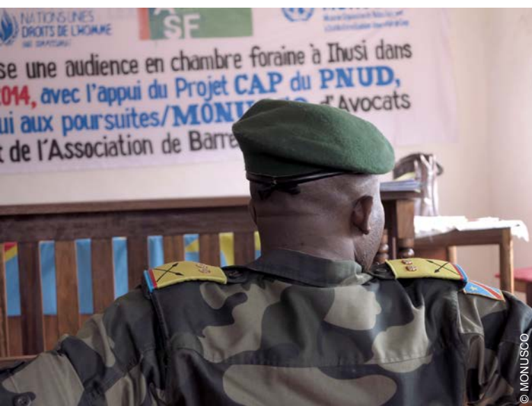
Trial of senior officers of the Congolese armed forces in the village of Kalehe, South Kivu, Democratic Republic of the Congo.

military justice system by transferring jurisdiction for grave crimes committed during conflict to the Specialized Chambers of the Court of Appeal. The Bill, however, was rejected by the Parliament, as it was in 2011. To promote support for improved measures of accountability for grave crimes, each of the UNJHRO field offices in Goma, Bukavu, Lubumbashi, Bunia and Kisangani organized one-day workshops in June and July to sensitize civil society organizations in eastern DRC about reform proposals in the area of transitional justice. The workshops were designed to inform civil society organizations in the regions most affected by conflict so that they would be empowered to advocate with Members of Parliament from their regions on the importance of the proposed reforms. Following the workshops, participants from all five regions issued collective letters to their regional parliamentarians.