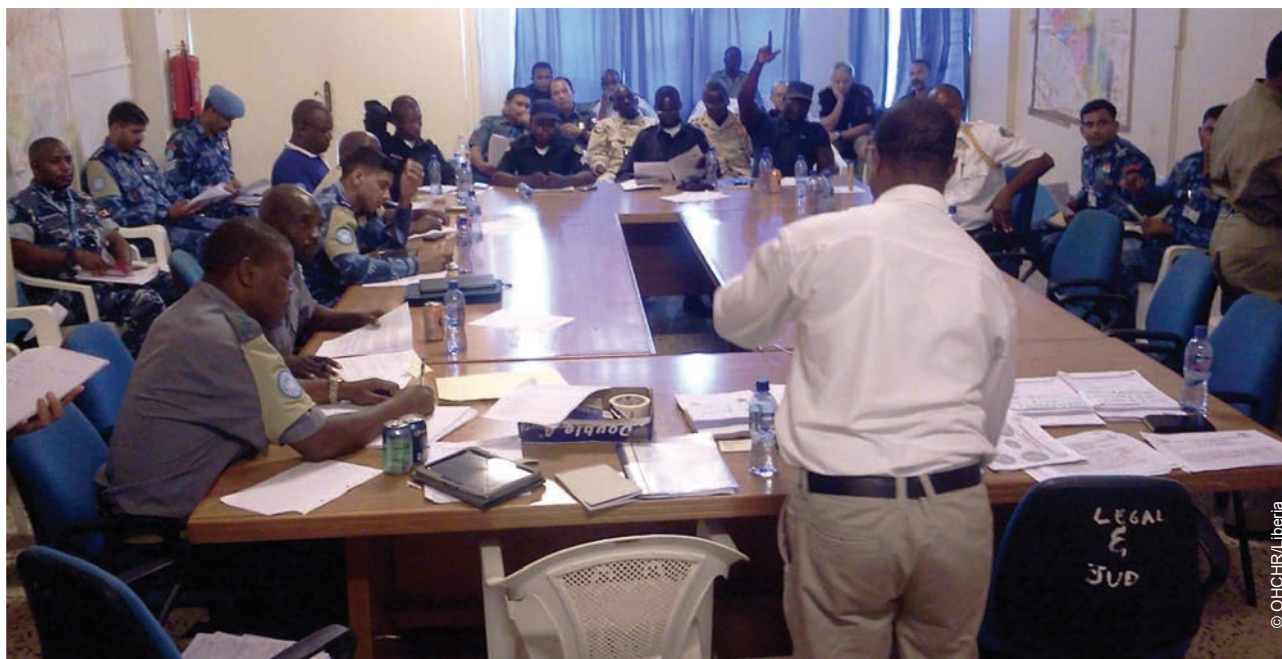
A human rights officer facilitating a training session on the Human Rights Due Diligence Policy to staff of UNPOL and the Liberia National Police.

Disability Task Force for the roll out and monitoring of the strategy.