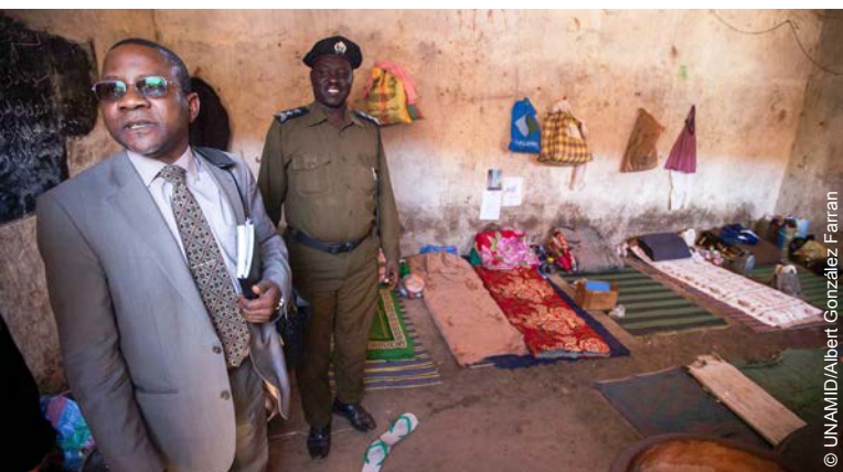
The Independent Expert on the situation of human rights in Sudan visits a prison in Zalingei, Central Darfur, as part of his official visit to Sudan.

The HRS carried out various activities in cooperation with UN agencies which contributed to mainstreaming human rights into the work of the UNCT. To enhance the capacity of UN personnel to monitor and report on cases of conflict-related sexual violence and to foster coordination between UNAMID and the UNCT on preventing and addressing conflict-related sexual violence, the HRS conducted a three-day training for 14 United Nations personnel from 27 to 29 May.