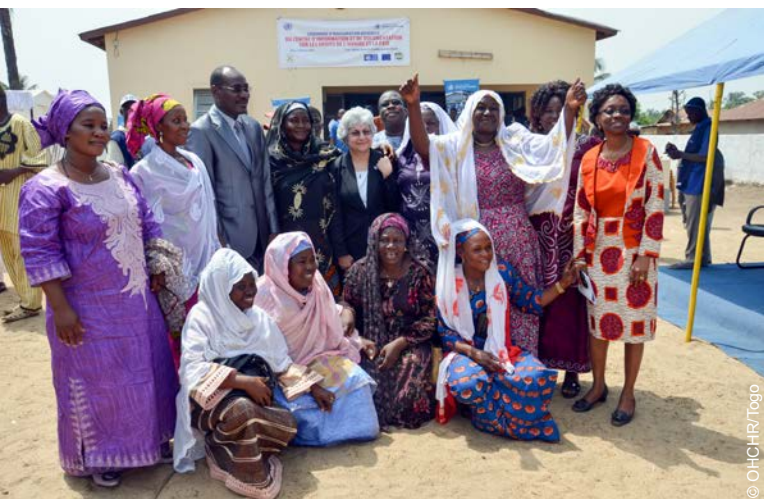
The Deputy High Commissioner inaugurates a human rights and peace resource centre in Sokodé, Togo, February 2014.