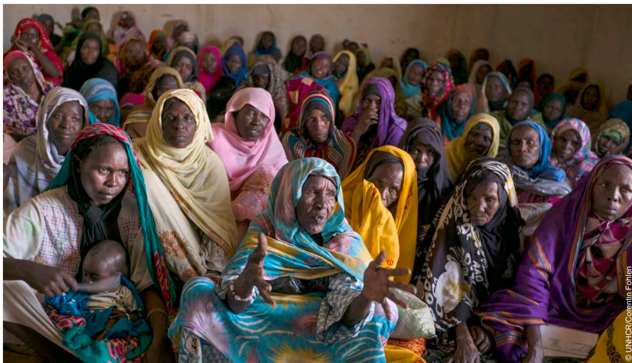
Women at a refugee camp in Chad.