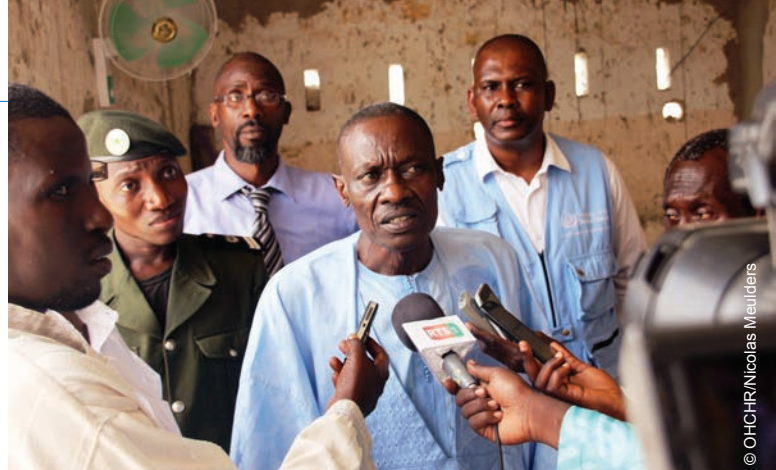
Press briefing after a monitoring visit to the prison in Diourbel, Senegal, jointly undertaken by OHCHR and Senegal's National Observer of Places of Deprivation of Liberty.

Frequent collaboration and exchange of information between OHCHR and civil society organizations in the Gambia led to their increased use of international human rights mechanisms. For instance, 14 submissions were made in anticipation of the second cycle of the UPR.