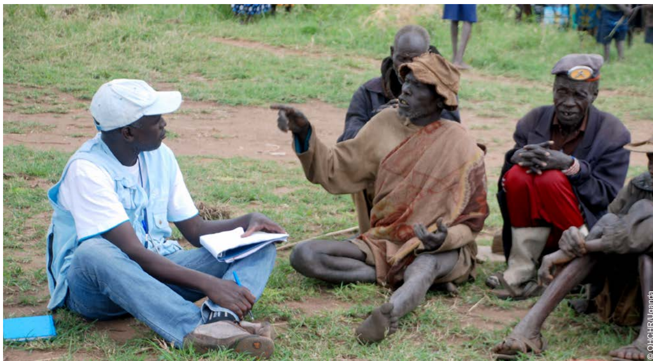
A human rights officer meets with representatives of the Ik community in Uganda.

actors play in the administration of justice and their willingness to transfer cases to the formal justice system. OHCHR organized 13 training sessions in northern Uganda for 210 traditional leaders and elders from Moroto, Kotido and Napak districts who received training on human right standards and their role in supporting the modern justice system. A round-table meeting was also organized for key traditional leaders and formal justice system representatives from the three districts to improve their working relationships. Based on the skills the traditional leaders acquired, the leaders requested the modern justice institutions to recognize the role of the traditional leaders in the administration of justice. Some traditional leaders referred and transferred criminal cases to the police or the courts, an indicator that they could now discern that criminal cases could be tried fairly by a competent modern court instead of in traditional courts. Additional engagement is required to determine how the traditional leaders applied the standard on non-discrimination in relation to women and girls and other human right standards when arbitrating justice in their communities.