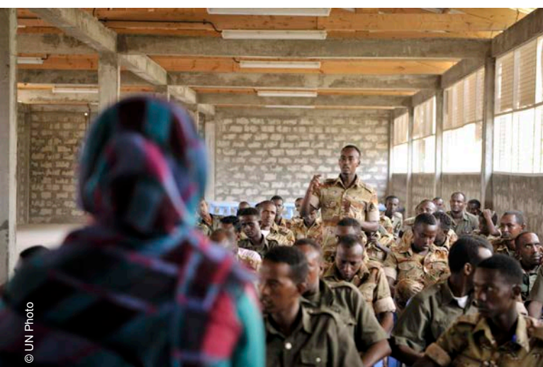
A human rights officer facilitating a workshop on human rights for members of the Somali National Army in Mogadishu, Somalia.

The quarterly reports to the Security Council, as well as other UNSOM documents, are informed by human rights analysis. The HRS contributes to the development of the documents and consistently advocates for the inclusion of specific human rights language. The HRS also contributes human rights analysis to the Inter-Agency Standing Committee's Early Warning Reports and the Security Council's Informal Expert Group on Protection of Civilians.