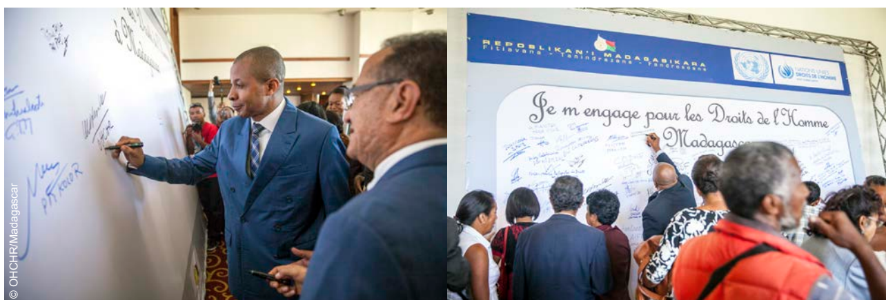
The Prime Minister of Madagascar, the Human Rights Adviser and other participants at the celebration of Human Rights Day sign a commitment to promote and protect human rights, December 2014.