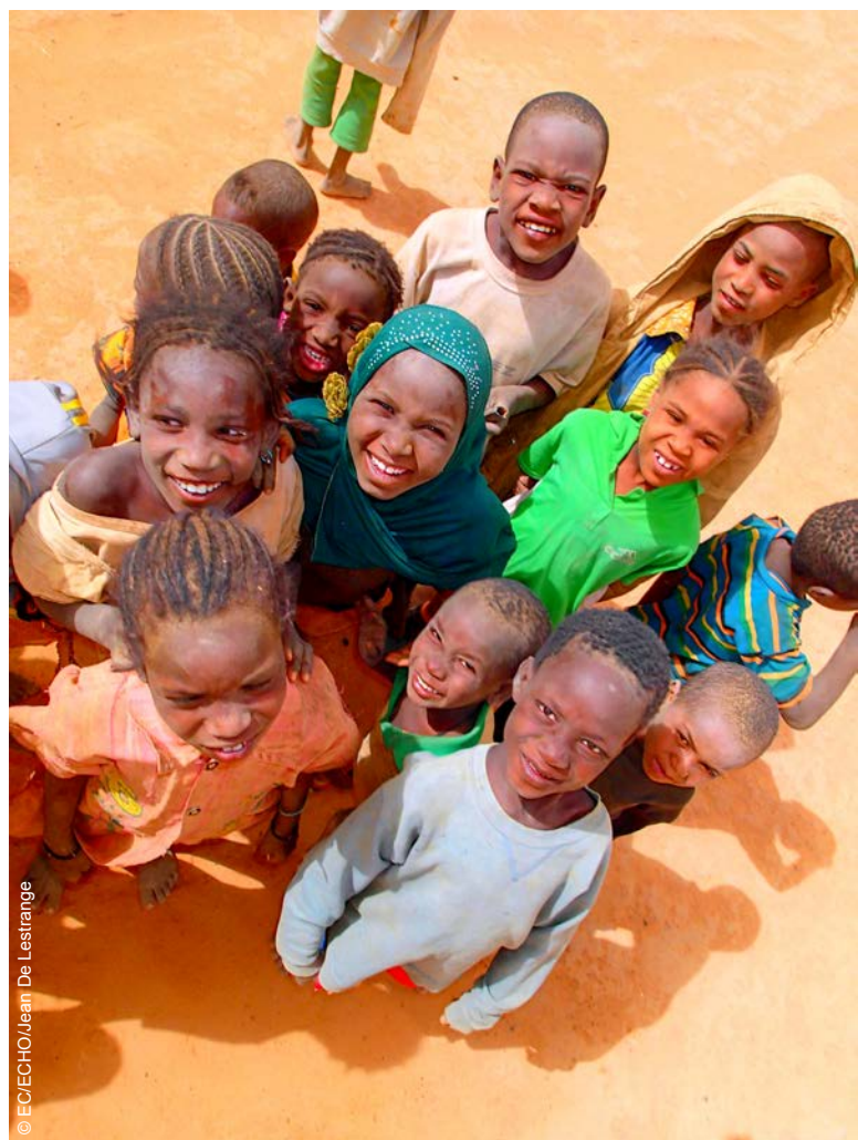
Children in a refugee camp in Niger.

into the work of UN agencies and the UN's capacity to advocate for respect for human rights was strengthened by the efforts of the UN Human Rights Working Group, led by the HRA. The Adviser also led the preparation of a Joint Annual Work Plan for 2015 between the MHRC and six UN agencies, which was signed on 16 December. In addition, the UN established a five-year right to food project integrating recommendations of the Special Rapporteur on the right to food. Human rights were integrated into elements of a joint programme on Sexual, Reproductive, Maternal and Child Health in Malawi, in conjunction with UNFPA. The aim of the programme is to follow up on a national assessment of sexual, reproductive, maternal and child health in Malawi, the legal and policy environment, existing initiatives, identified gaps and the obstacles to and opportunities for realizing these rights. Following the UN's advocacy, including a meeting between the United Nations Country Team and the Speaker of Parliament and the preparation of a comprehensive briefing note by the HRA, a Parliamentary Human Rights Committee was established in September.