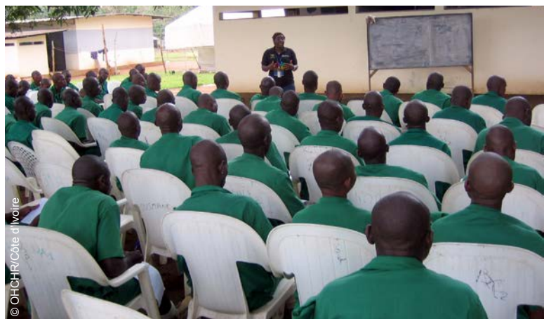
A human rights officer facilitating an awareness-raising activity with 600 ex-combatants in Bouake, Côte d'Ivoire.

providing the NHRC with technical advice for the drafting of its planning documents. After the workshop, the NHRC drafted its strategic plan which is currently pending adoption.