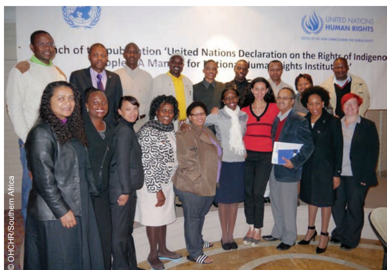
Participants at an OHCHR meeting on indigenous peoples for national human rights institutions in Southern Africa.

Angola acceded to the International Convention on the Rights of Persons with Disabilities and its Optional Protocol on 19 May and signed the International Convention for the Protection of All Persons from Enforced Disappearance on 24 September. Mozambique acceded to the Optional Protocol to the Convention against Torture and Other Cruel, Inhuman or Degrading Treatment or Punishment on 1 July. Madagascar signed the International Convention on the Protection of the Rights of All Migrant Workers and Members of Their Families on 24 September. The Regional Office advocated for the ratification