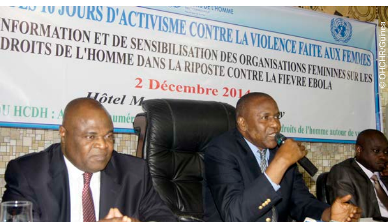
A representative of Guinea's Ministry of Human Rights and Public Liberties speaks at the opening ceremony of an OHCHR event on human rights in the response to the Ebola crisis, December 2014.