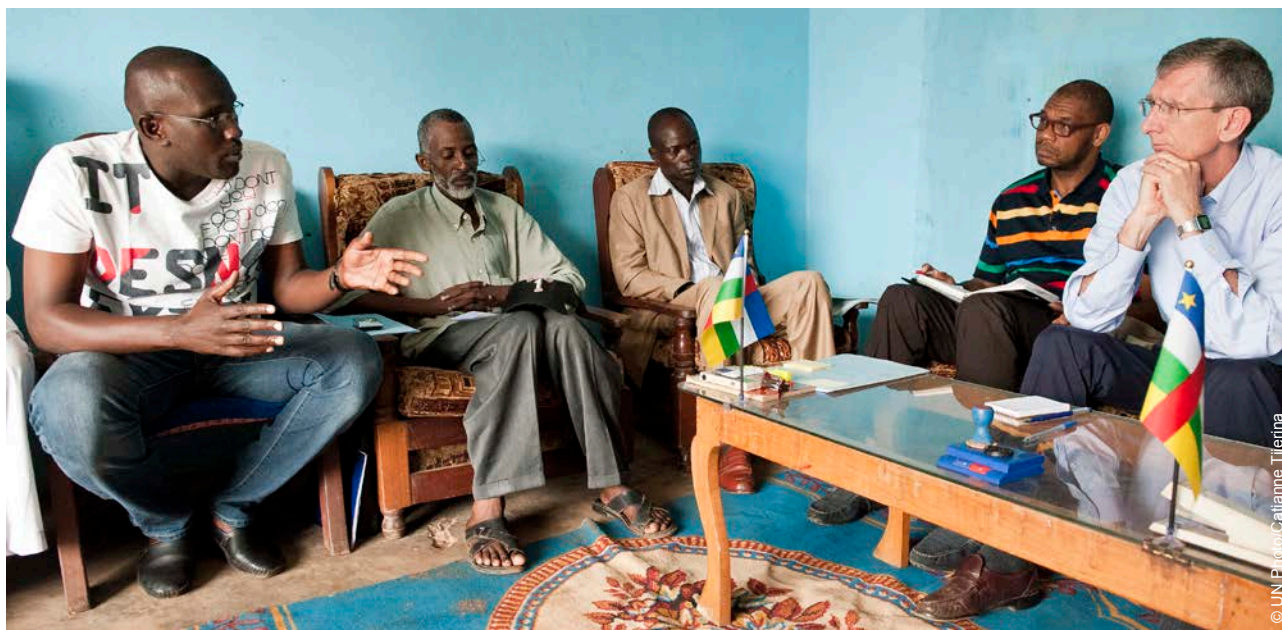
The Chief of the Human Rights and Justice Section of the United Nations Multidimensional Integrated Stabilization Mission in the Central African Republic meets with local Muslim leaders in Bangui.

Guidelines for the Urgent Temporary Measures to address impunity were drafted, with the support of the HRJS, and signed by the Government. In addition, MINUSCA and the Ministry of National Reconciliation, Political Dialogue and Promotion of Civic Culture co-organized a workshop on human rights and transitional justice for representatives of the Government, civil society organizations, the Bangui Bar Association and other national institutions to familiarize participants with the principles and pillars of transitional justice.