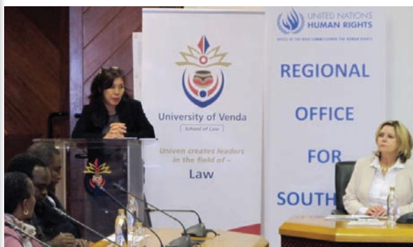
The Deputy Representative of the OHCHR Regional Office for Southern Africa speaks at the opening ceremony of a human rights resource centre at the University of Venda in South Africa.

In Benin, the National Action Plan on Human Rights was validated with the support of the Regional Office. The Regional Office also advocated for the strengthening of the national coordination mechanism in charge of reporting to the human rights mechanisms and monitoring the implementation of their recommendations. The three ministries in Burkina Faso that are in charge of State reporting harmonized their procedures with OHCHR's support. The Office also provided technical support to the preparation of all reports drafted in 2014, including to the Committee on the Elimination of Discrimination against Women and the Committee on Enforced Disappearances. The Government of the Gambia elaborated its national report to the Universal Periodic Review, although with limited consultation with civil society. In Senegal, OHCHR and UNICEF supported the establishment and functioning of a technical committee to review the National Human Rights Action Plan in