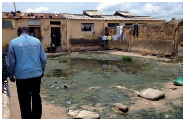
OHCHR staff monitoring a detention centre in Senegal.

OHCHR continued to support the elaboration of indicators for evaluating the advances and impact of public policies on human rights. In Mexico, the OHCHR indicators framework was formally adopted by 32 local level judicial powers and the Tribunal of Justice of Mexico City produced