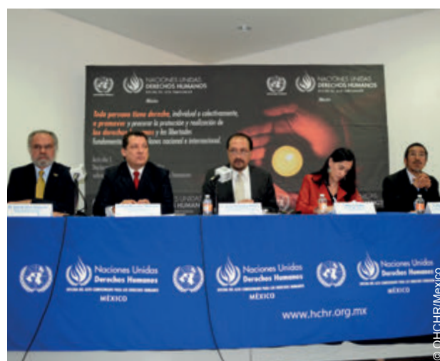
The OHCHR Representative in Mexico presents the Human Rights Defenders Report 2013 in Mexico.

In Paraguay, the National Human Rights Action Plan (NHRAP) was adopted. OHCHR assisted the authorities with the drafting through workshops, trainings, seminars and awareness-raising activities. OHCHR promoted the application of a