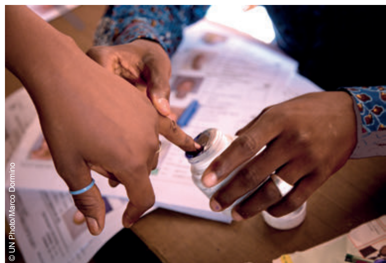
Malians vote during the presidential election, July 2013.

In Niger, the National Human Rights Commission (NHRC) was formally inaugurated in May 2013.