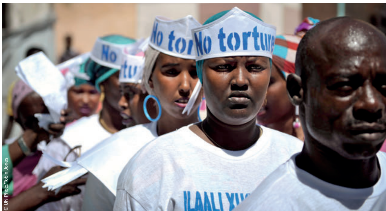
Demonstrators advocating for the end of torture during Human Rights Day celebrations in Somalia.

In Uganda, in cooperation with the Uganda Human Rights Commission (UHRC) and civil society organizations in the framework of the Coalition against Torture, OHCHR analysed draft legislation on the prevention and prohibition of torture and undertook advocacy in Parliament. The resulting Prevention and Prohibition of Torture Act, adopted in 2012, is coherent with the provisions of the Convention against Torture and Other Cruel, Inhuman or Degrading Treatment or Punishment (CAT).