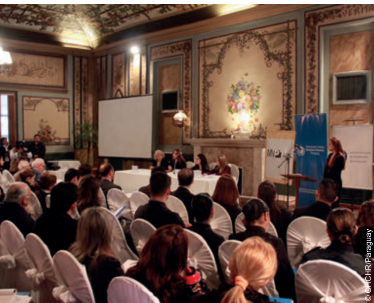
Seminar on national preventive mechanisms organized by OHCHR in Paraguay.

suspects. The Human Rights and Transitional Justice Section of the former United Nations Integrated Mission in Timor-Leste (UNMIT) monitored the cases and submitted written information on the allegations to the Prosecutor's Office.