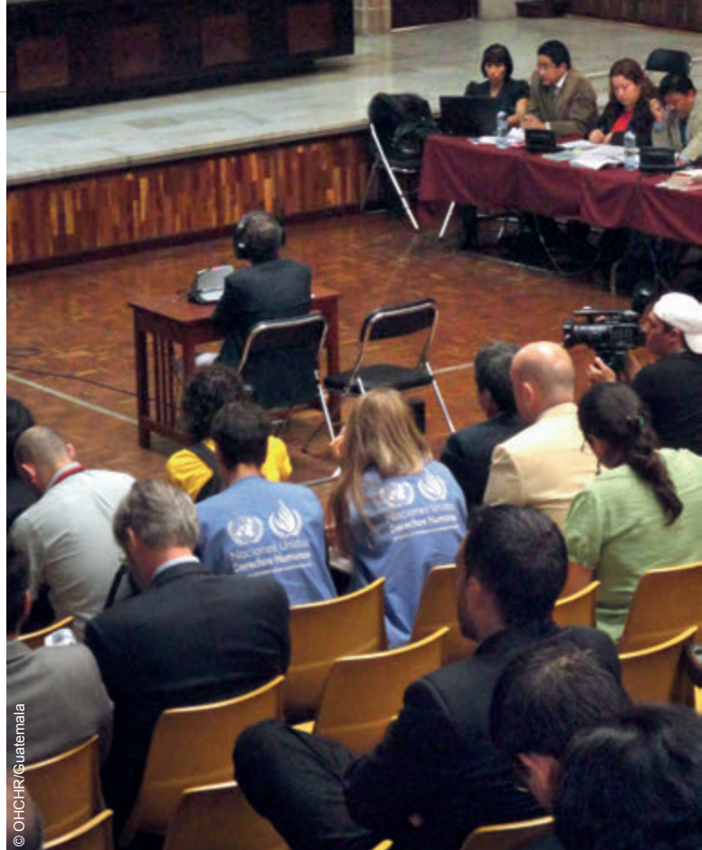
OHCHR staff monitor the trial of the former President of Guatemala, Efraín Ríos Montt, March 2013.

In implementing its impunity strategy, OHCHR devotes particular attention to supporting national capacities to strengthen the rule of law and accountability and combat impunity, including through the development of practical guidance tools (i.e., the Secretary-General's Guidance Note on the United Nations Approach to Transitional Justice ). Through its field presences, the Office has developed the capacity to work in close cooperation with States and all other stakeholders, including national human rights institutions (NHRIs), providing technical assistance, capacity-strengthening activities and advisory services to assist duty-bearers to implement the provisions of international human rights instruments and recommendations issued by the human rights mechanisms. Moreover, the Office contributes to strengthening the rule of law and combating impunity through monitoring, documenting and reporting on human rights violations.