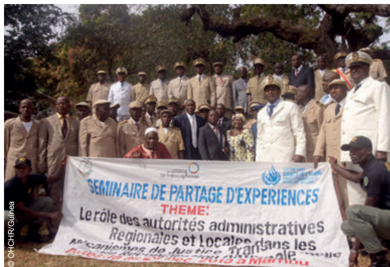
Participants of the OHCHR workshop on transitional justice mechanisms organized in Guinea, December 2013.

Further sustained efforts are needed to create the conditions for national justice systems to protect human rights and ensure access to justice for all, including members of the most vulnerable groups and those most subject to discrimination. While progress has been made to assist States in ensuring accountability for violations of human rights and international humanitarian law, additional efforts are required to secure the commitments of States to counter impunity and strengthen national capacities to investigate and prosecute international crimes. OHCHR will also need to continue its advocacy and strengthen its capacity to assist States in developing