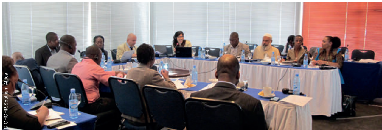
Capacity-building activity facilitated by OHCHR for commissioners of Mozambique's National Human Rights Institution.

Legislation establishing the Commission was adopted and promulgated in 2012 in compliance with the Paris Principles, including by providing guarantees for the Commission's independence and financial autonomy. OHCHR and the UNCT advocated for the establishment of the NHRC, carried out trainings on the Paris Principles and provided technical advice and guidance. In Somalia, the Government adopted legislation for the creation of a commission for human rights in June 2013. The bill is before the Parliament for possible adoption in 2014. The UNSOM Human Rights Component presented parliamentarians with an assessment of the bill's compliance with the Paris Principles and recommended that broader consultations take place with the regions and civil society. In Benin, following advocacy and technical support provided by OHCHR, new legislation was adopted by the National Assembly establishing a NHRI in compliance with the Paris Principles. OHCHR continues to advocate for the adoption of a decree appointing members of the new committee.