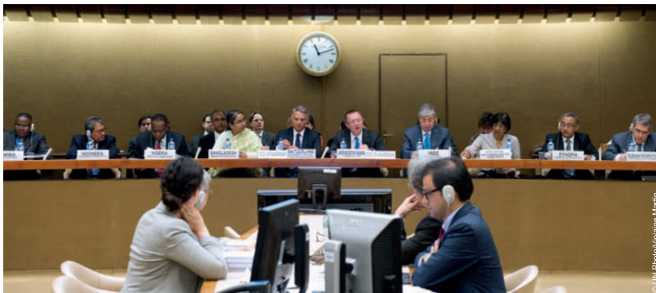
The High Commissioner participates in a meeting organized by the UN Counter-Terrorism Implementation Task Force Office in partnership with the Government of Switzerland, June 2013.

In Afghanistan, following a report published by the Human Rights Unit of the United Nations Assistance Mission in Afghanistan (UNAMA), entitled Treatment of conflict-related detainees in Afghan custody :